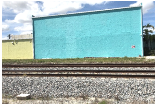
MAIN MURAL WALL