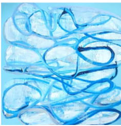
WATER MEMORY II

Presentations are communication tools that can be demonstrations, lectures, speeches, reports, and more.