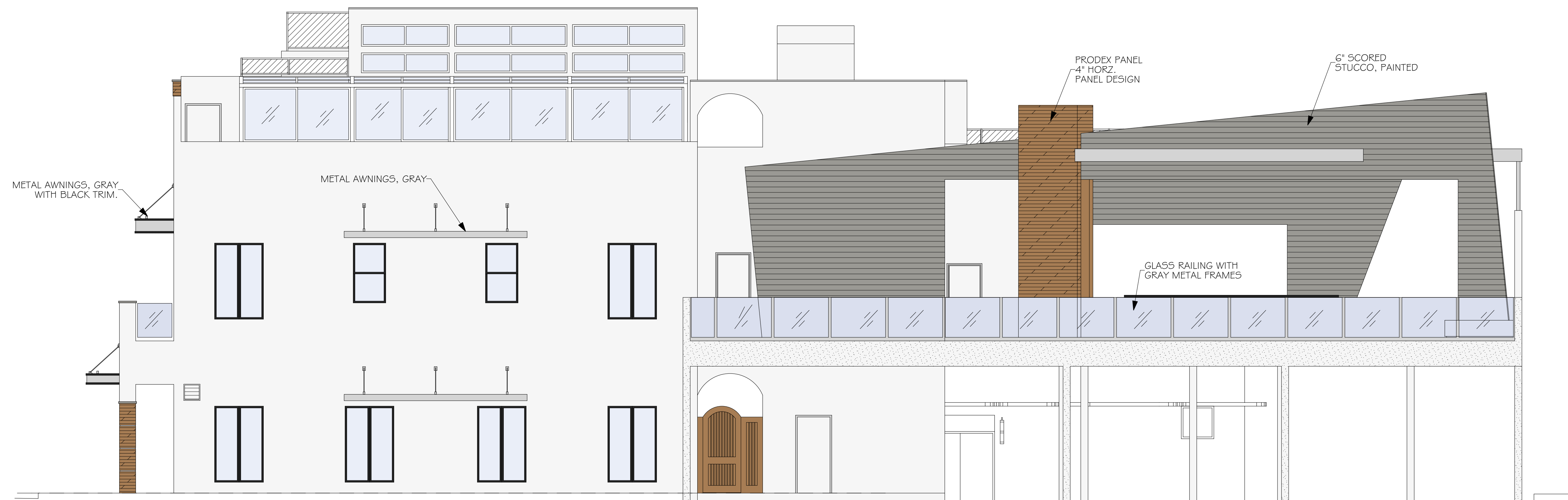
SIDE - EAST ELEVATION (PROPOSED) N.T.S