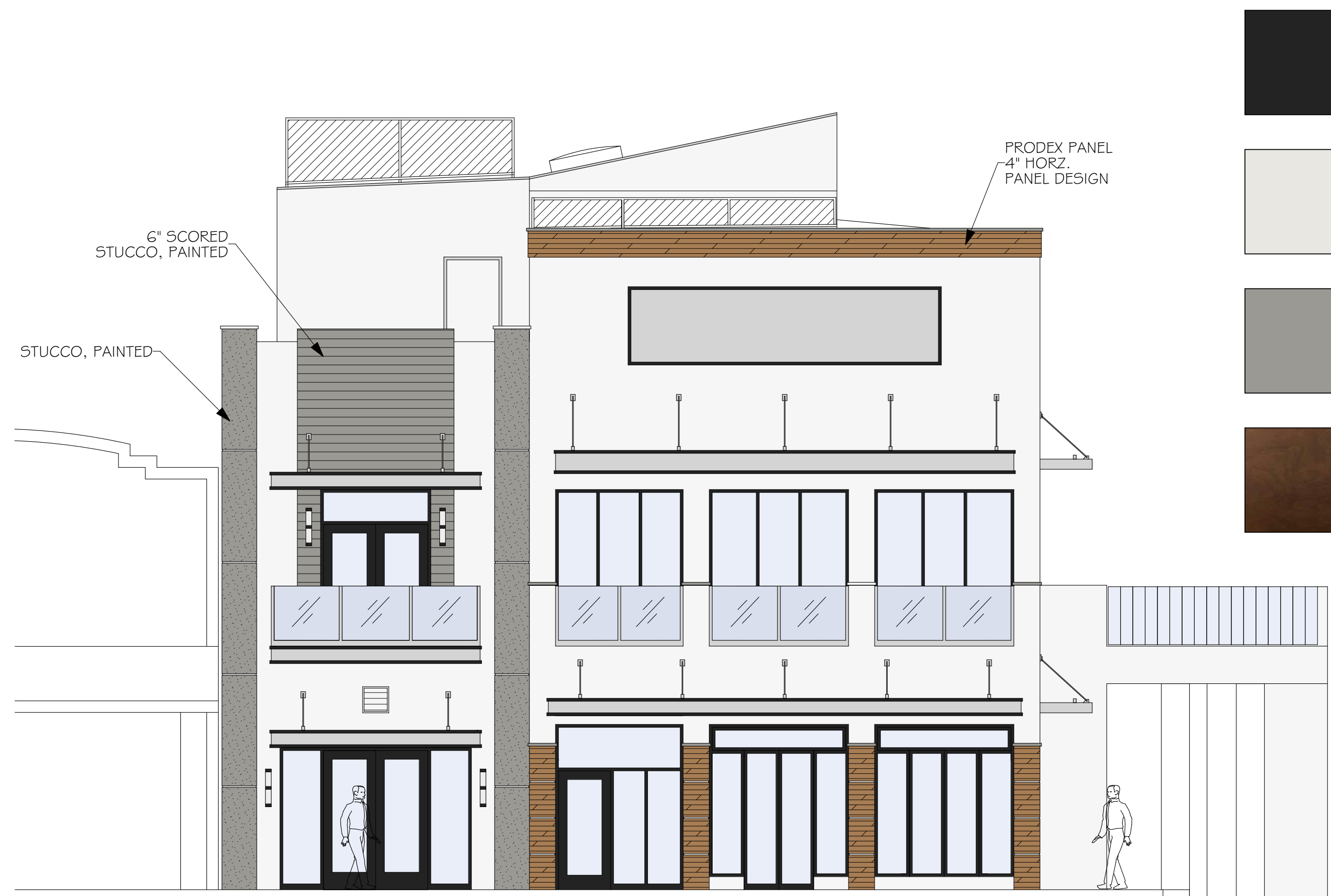
FRONT - SOUTH ELEVATION (PROPOSED) N.T.S