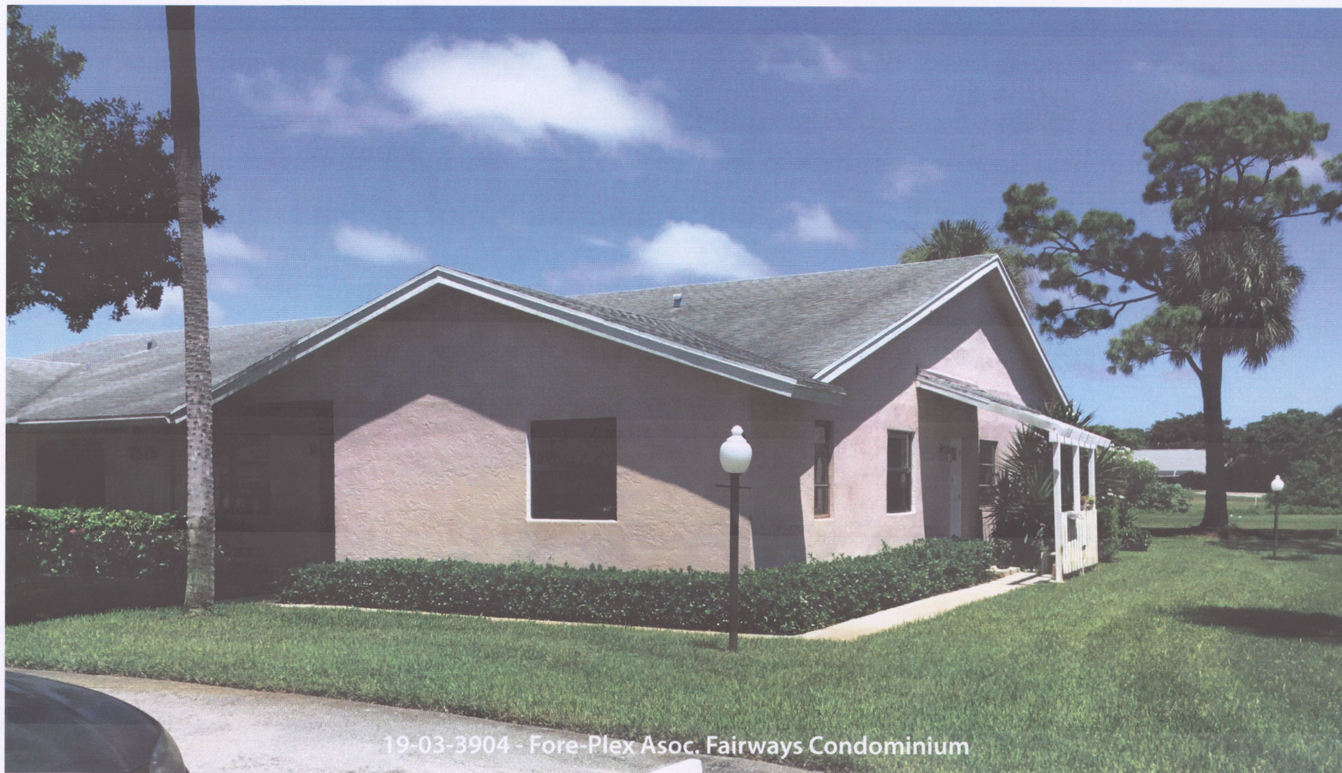
19-03-3904 - Fore-Plex Assoc. Fairways Condominium