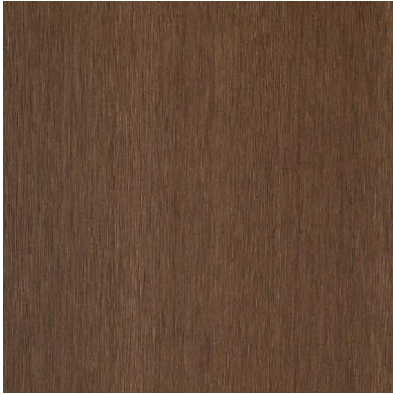
Boral TruExterior wood type finishes