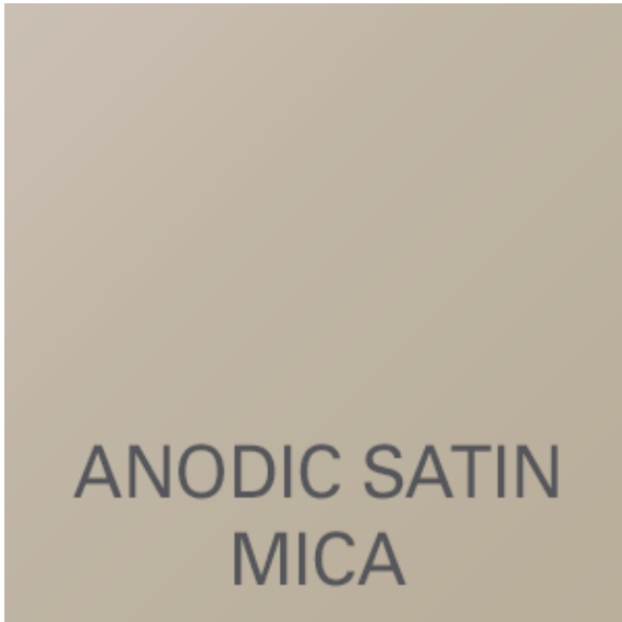
Wall Accent Alucobond