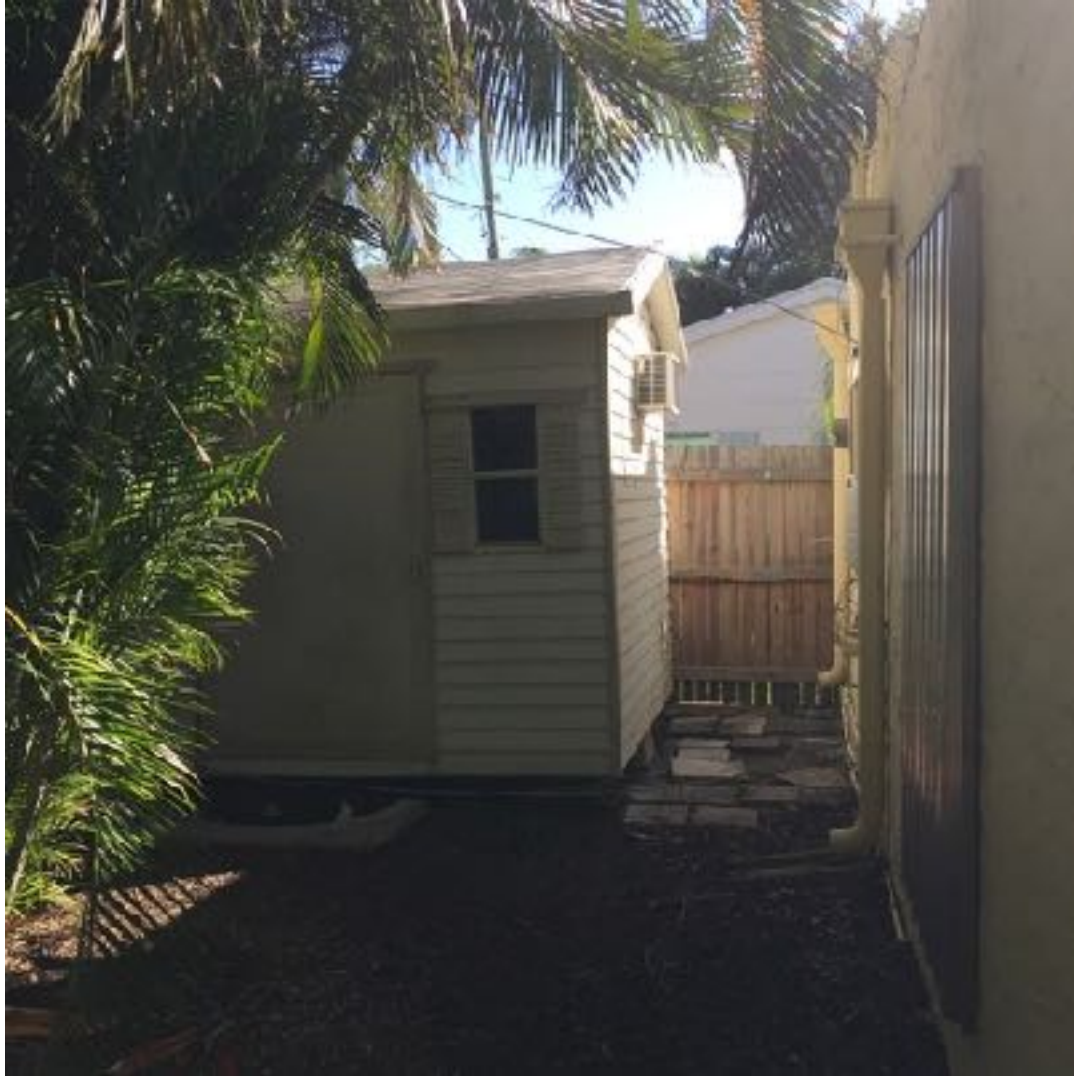
SOUTH ELEVATION BEFORE