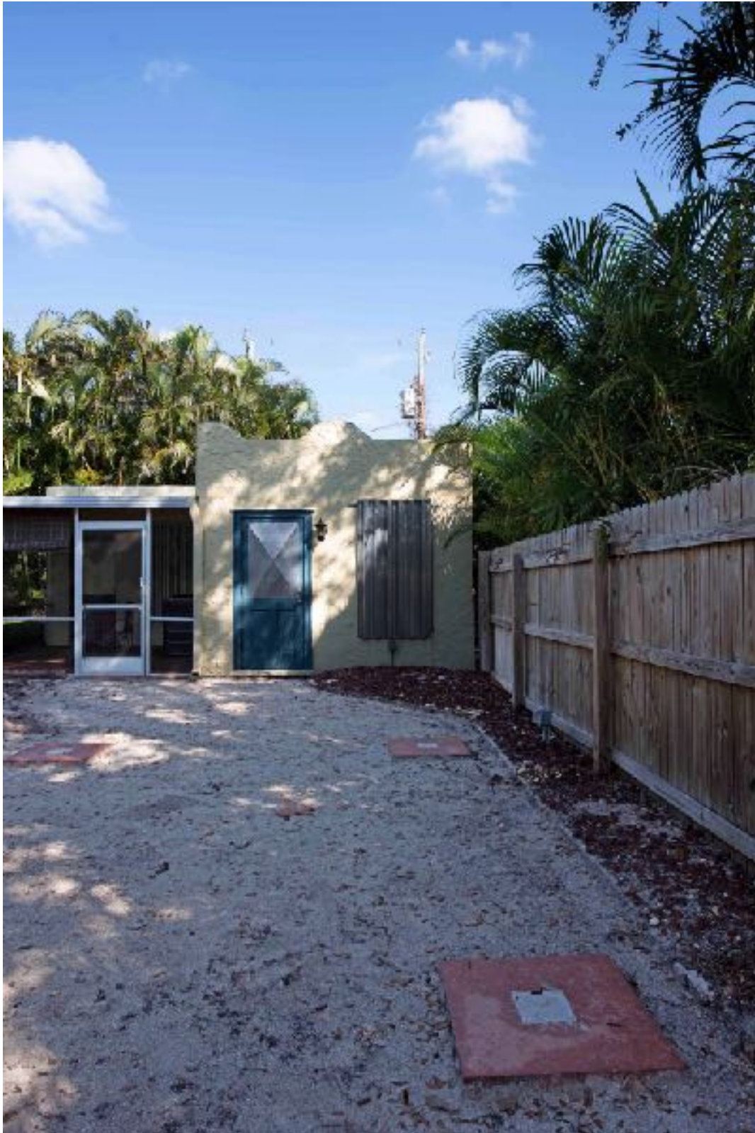
EAST ELEVATION BEFORE/ VIEW OF REAR COTTAGE