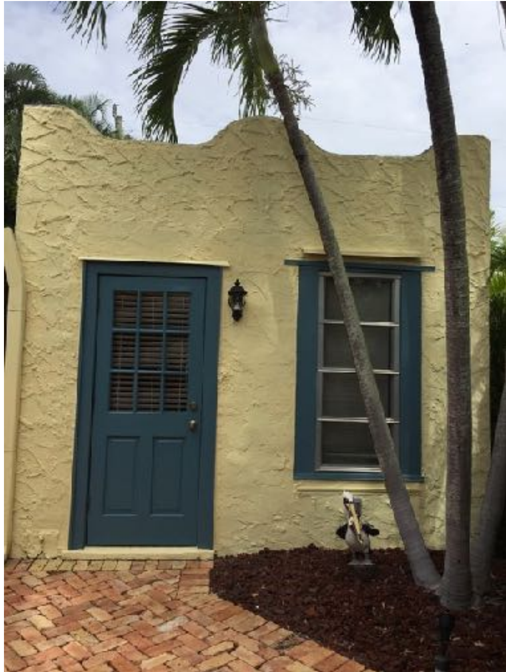
REAR COTTAGE EAST ELEVATION