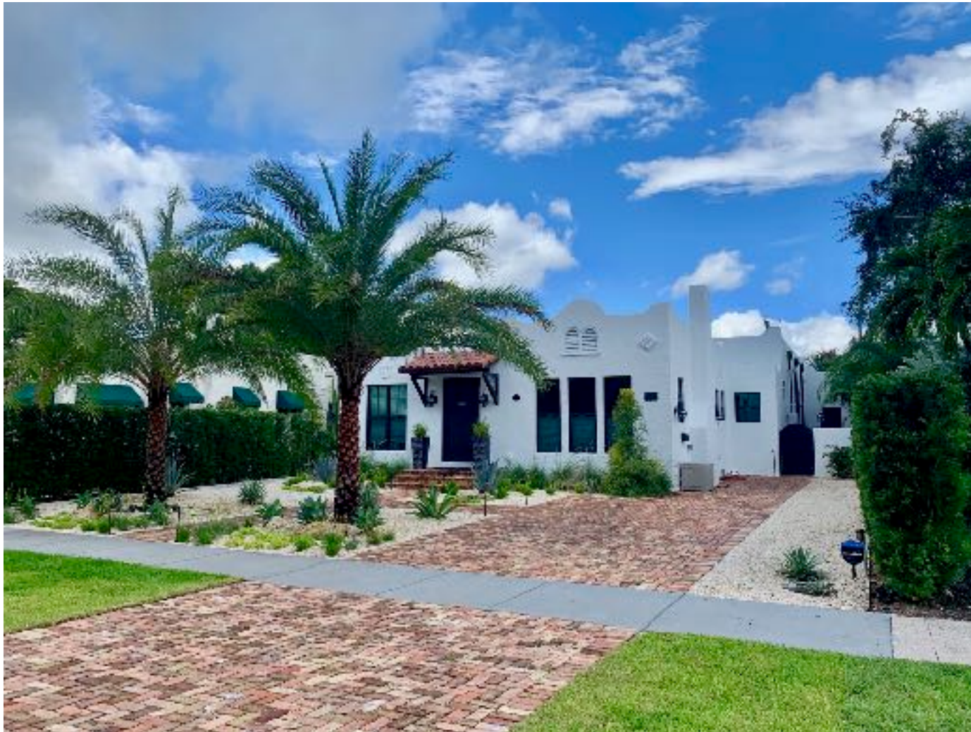
NORTH/EAST CORNER AFTER