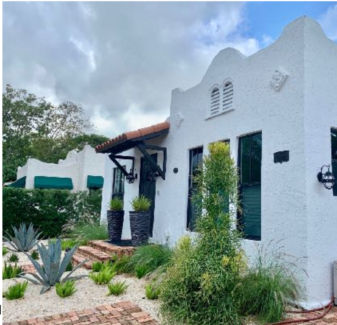
FRONT FACADE DETAIL AFTER