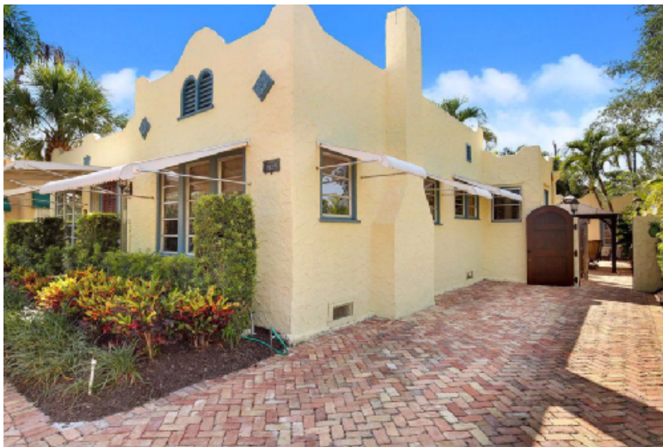
NORTH ELEVATION BEFORE