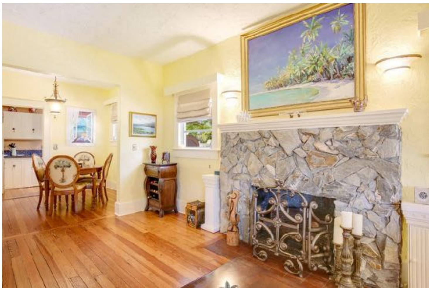
DINING ROOM BEFORE