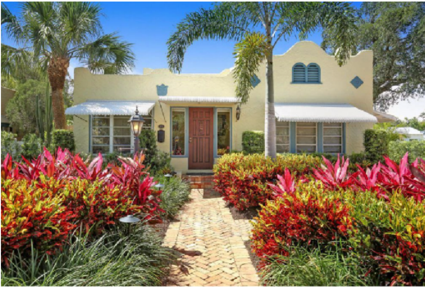
EAST ELEVATION BEFORE