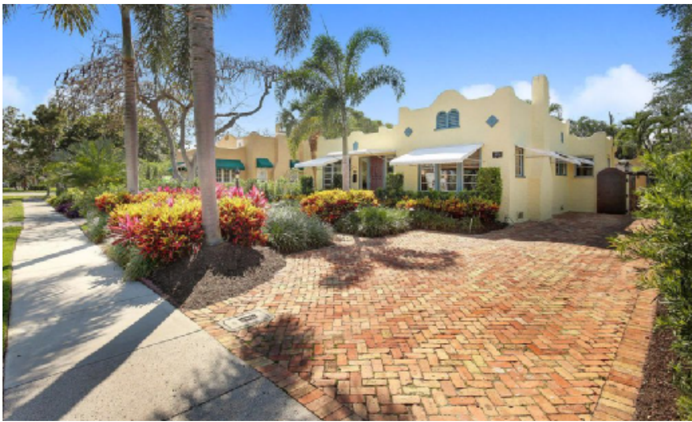
NORTH/EAST CORNER BEFORE