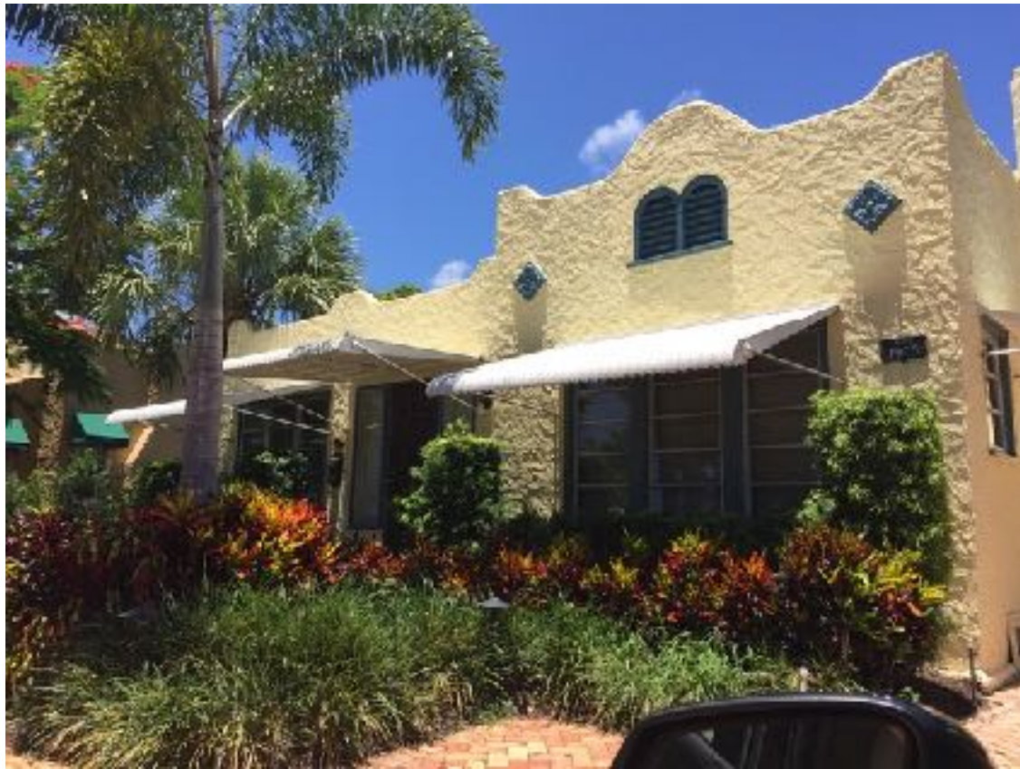
FRONT FACADE DETAIL BEFORE