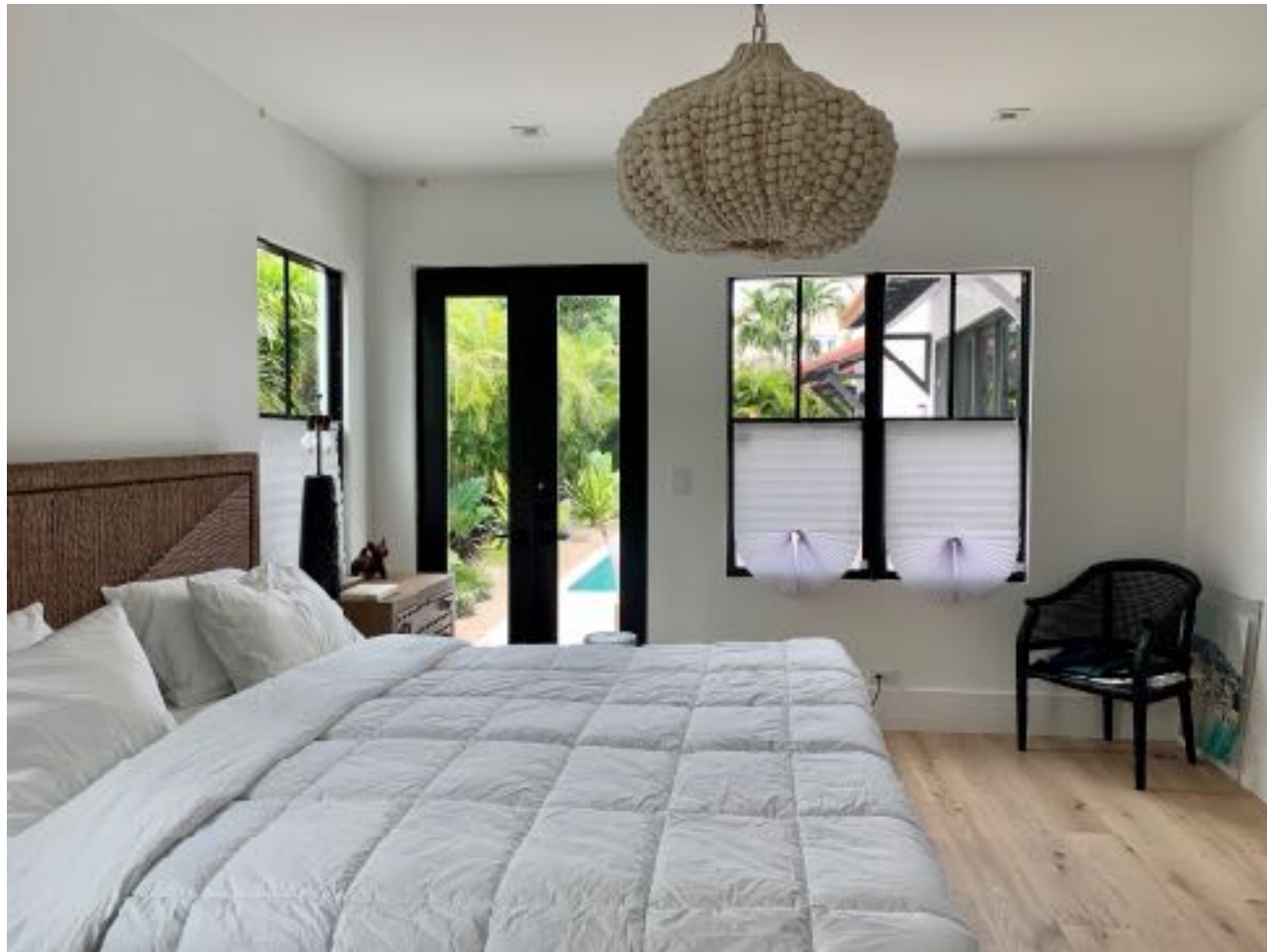
MASTER BEDROOM AFTER/ LOOKING WEST