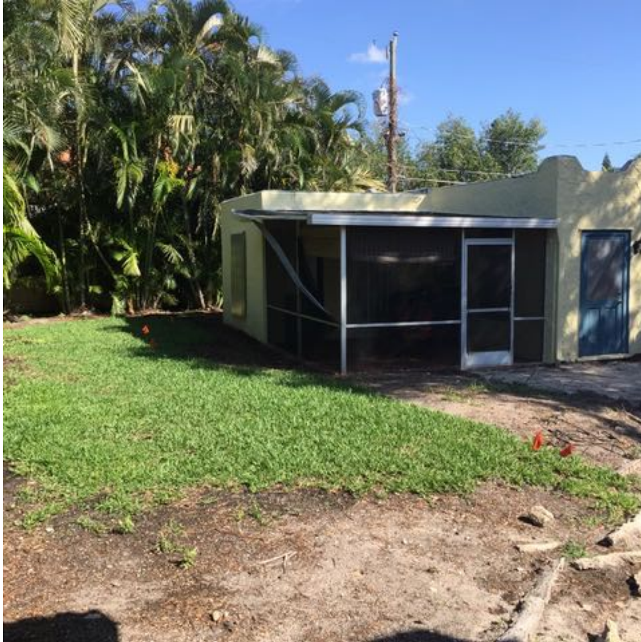
SOUTH ELEVATION BEFORE