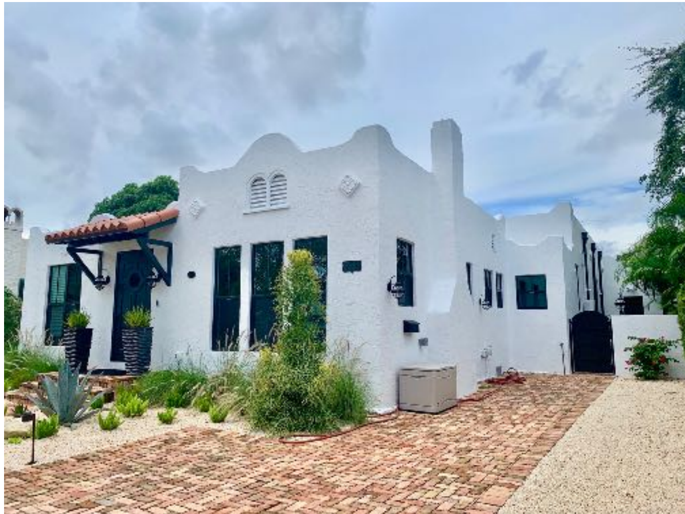
NORTH ELEVATION AFTER