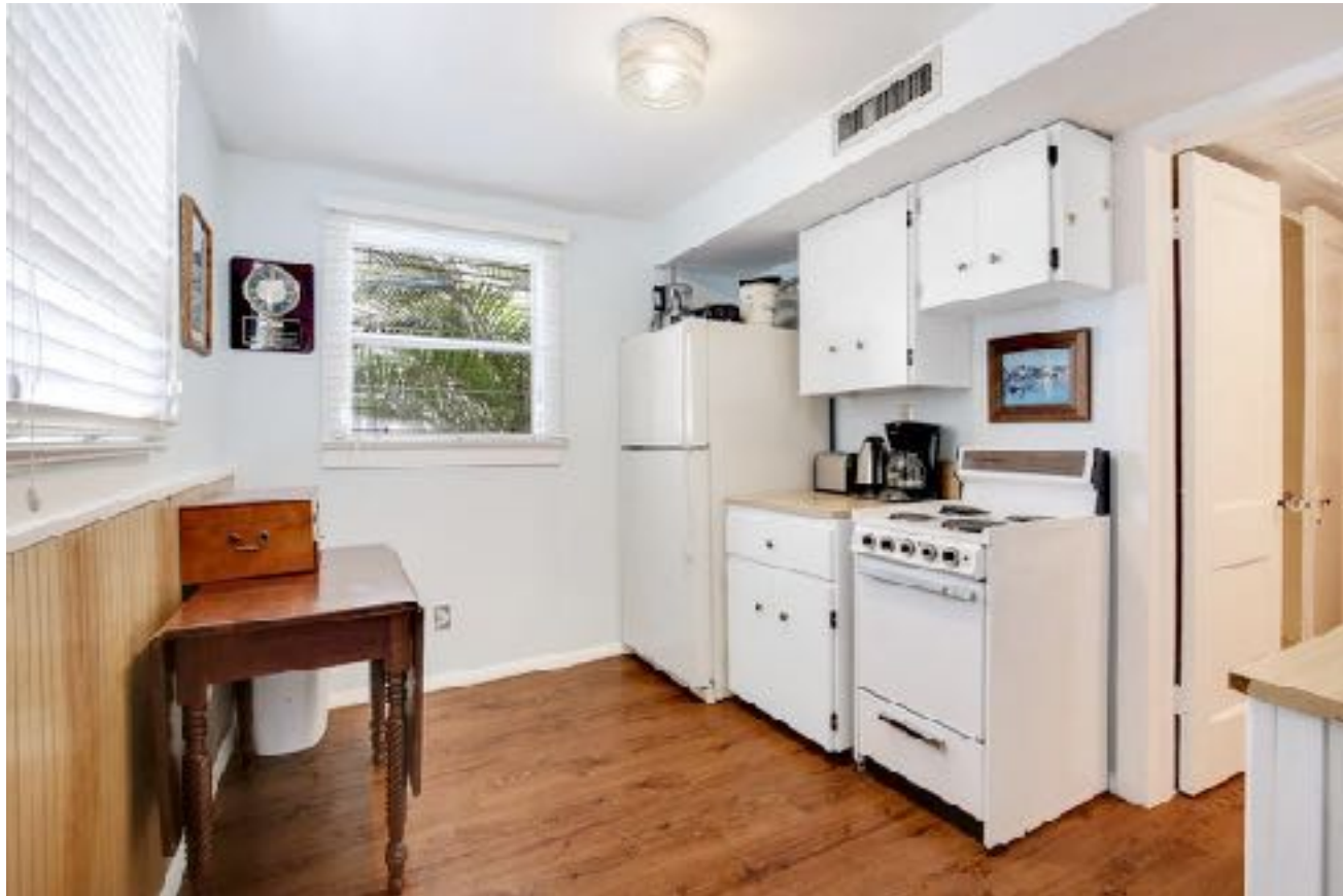
REAR COTTAGE KITCHEN BEFORE