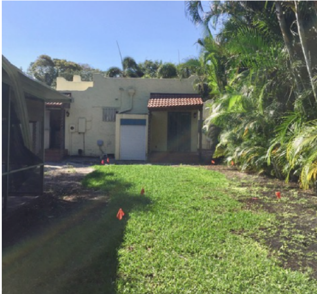
WEST ELEVATION BEFORE