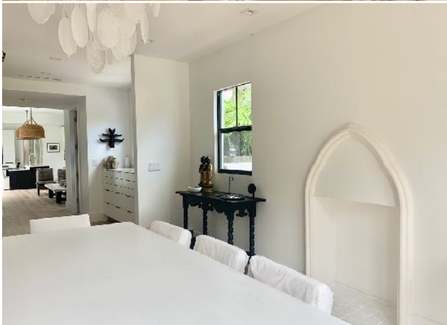
DINING ROOM AFTER