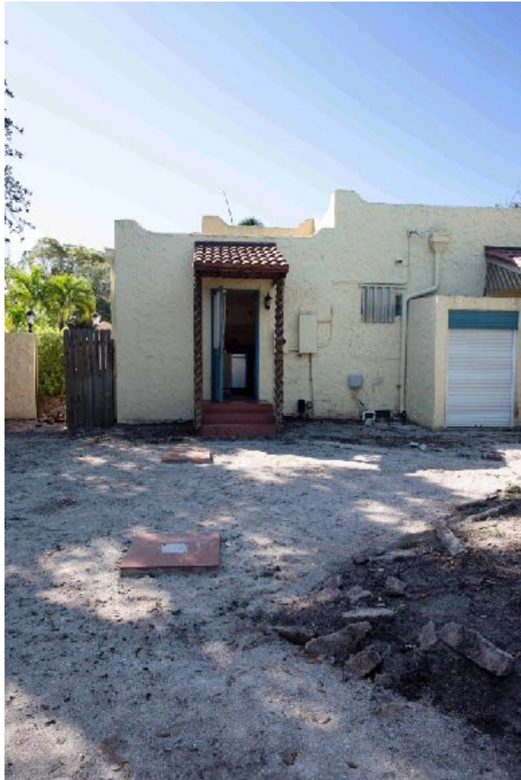
WEST ELEVATION BEFORE/ VIEW FROM REAR COTTAGE TO MAIN HOUSE