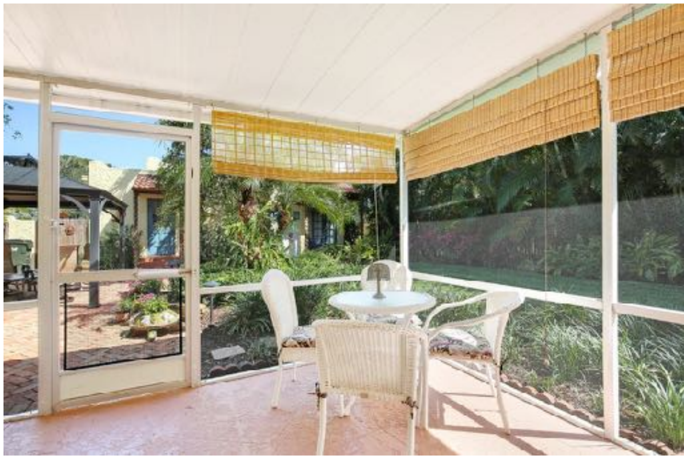
REAR COTTAGE PORCH/LAUNDRY BEFORE