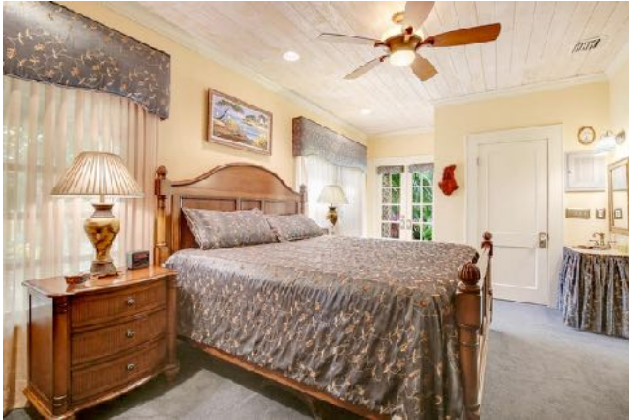
MASTER BEDROOM BEFORE/ LOOKING WEST