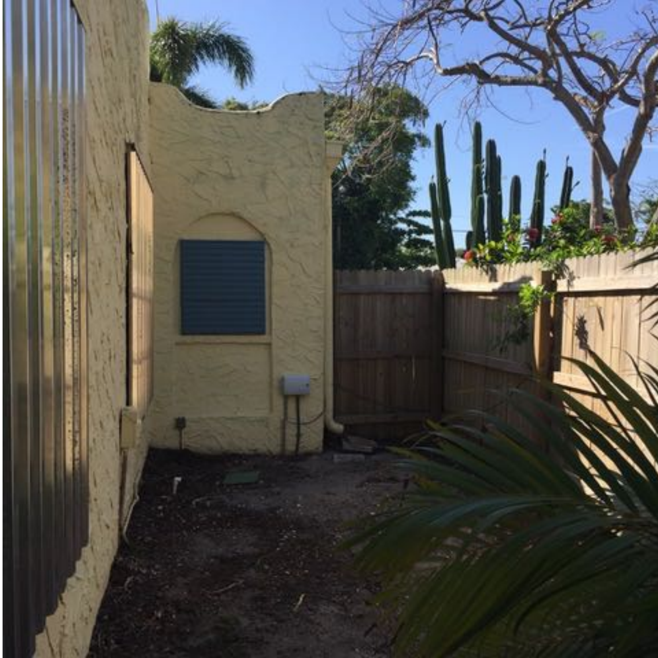
WEST ELEVATION BEFORE