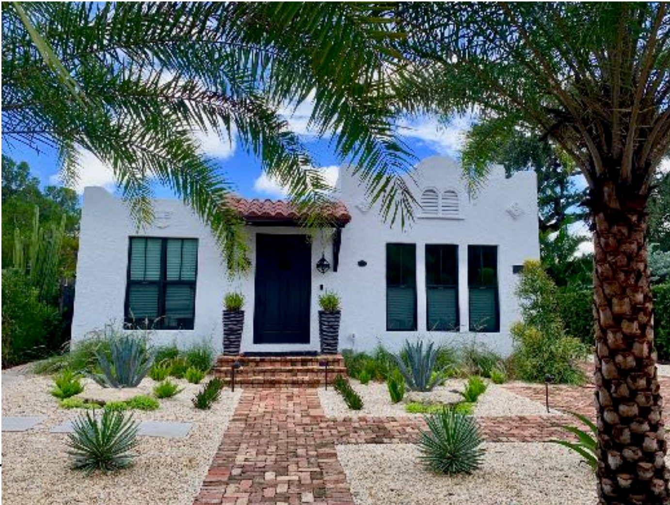
EAST ELEVATION AFTER