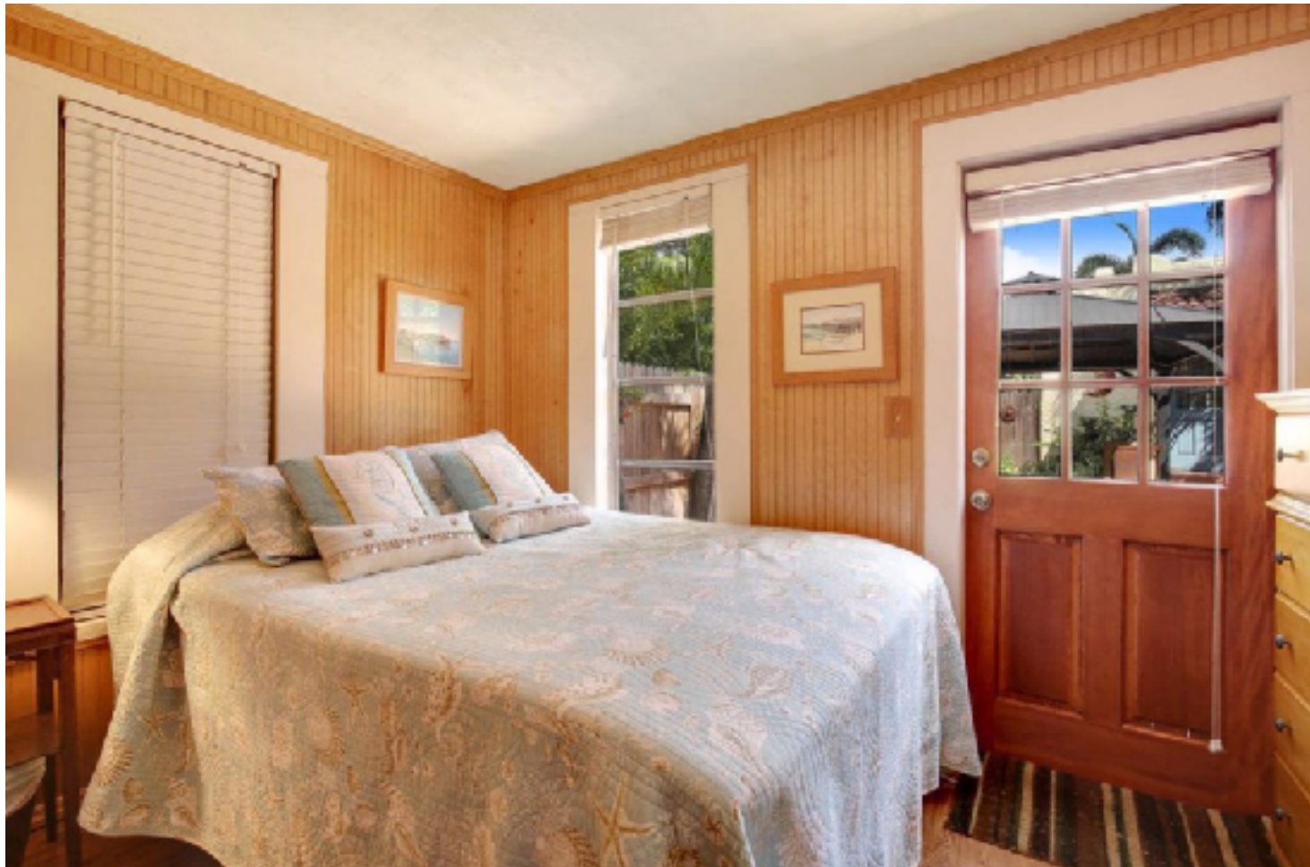
REAR COTTAGE BEDROOM BEFORE/ LOOKING EAST