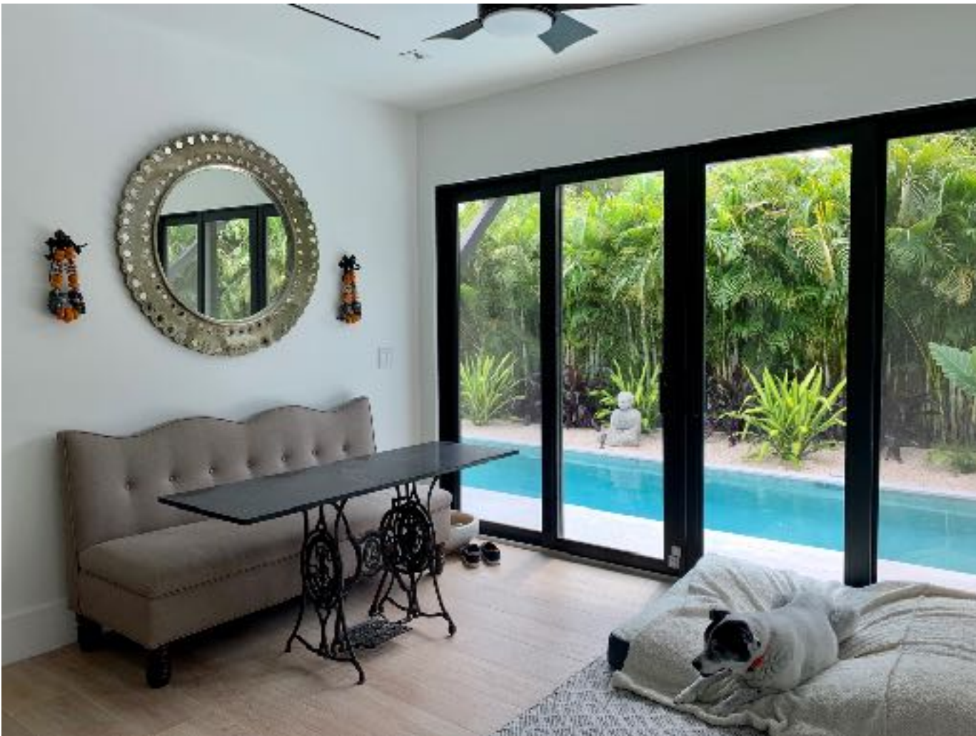
SAME VIEW AFTER-STUDIO