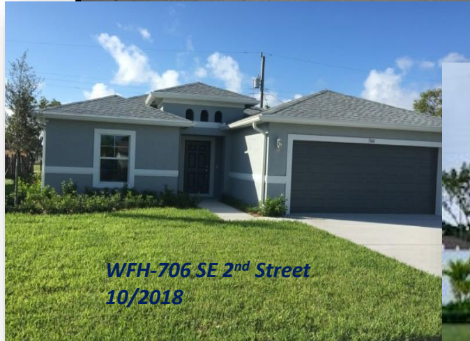
WFH-706 SE 2 nd Street 10/2018