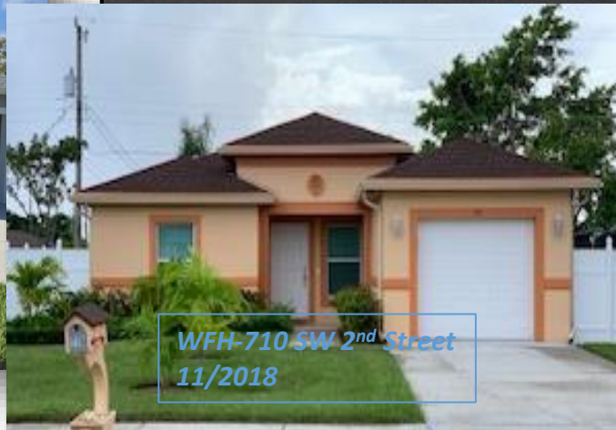
WFH-710 SW 2 nd Street 11/2018