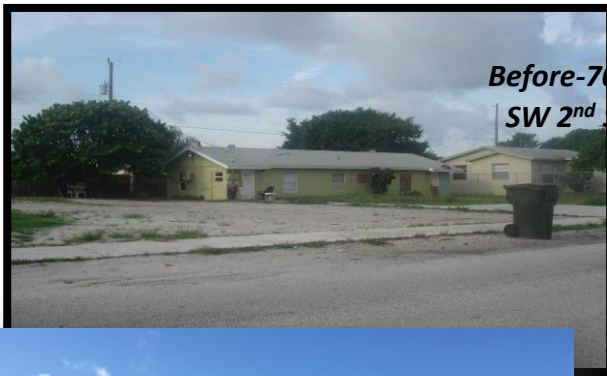
Before-706 & 710 SW 2 nd Street

"Building A Better Community One Home At A Time"