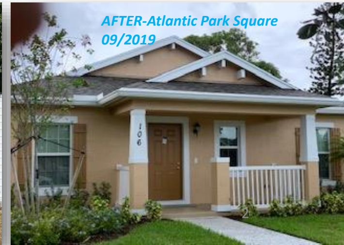
AFTER-Atlantic Park Square 09/2019