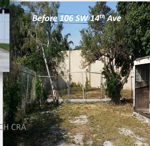
Before 106 SW 14 th Ave