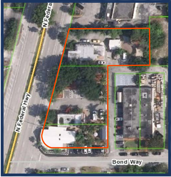
AERIAL PHOTOGRAPH (NOT-TO-SCALE)