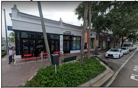
Existing storefront depth along the corridor

The subject site located at 302 E. Atlantic Avenue is not located adjacent to any existing bike lanes. The proposed waiver to reduce the 10' minimum required storefront setback to 7'-10" in order to increase the ground floor retail space does not appear to degrade the existing street and sidewalk network or negatively impact any adopted bicycle/pedestrian master plan. Sites along Atlantic Avenue are required to provide a minimum 15' streetscape area, and storefronts are required to have a minimum 10' setback. The sidewalk network exists along the Atlantic Avenue corridor. The waiver requested would allow for the first floor storefront façade to extend 2'-2" into the front setback, in order to increase the square footage of the retail space on the ground floor, and replacing the existing arcade. The arcade which was created prior to the current LDR is non-conforming. LDR Section 4.4.13 (E)(4)(f)1.,a., says that "arcades shall extend over the sidewalk and not parallel to the sidewalk, allowing pedestrians to bypass storefront windows." The replacement of the arcade with a decreased storefront depth that will aid in maintaining consistency of the frontage along the corridor. The existing arcade creates an inconsistency in the pedestrian flow by creating an offset in sidewalk width.