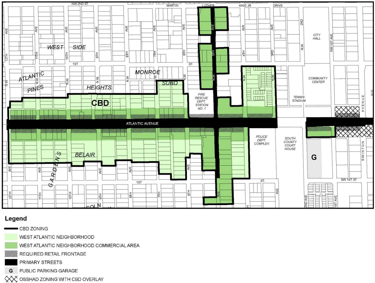
Figure 4.4.13-6 West Atlantic Neighborhood Sub-district Regulating Plan