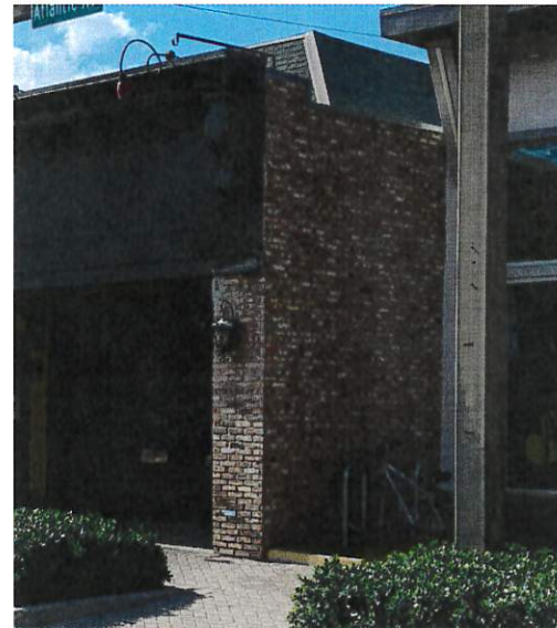
SIDE ELEVATION SIGNAGE (EAST FACING EXTERIOR WALL)