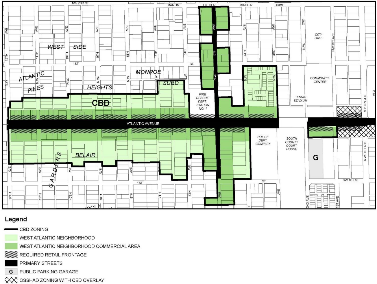
Figure 4.4.13-6 West Atlantic Neighborhood Sub-district Regulating Plan