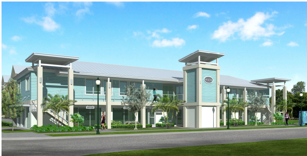
98 NW 5 th Avenue