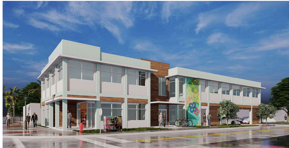
95 SW 5 th Avenue