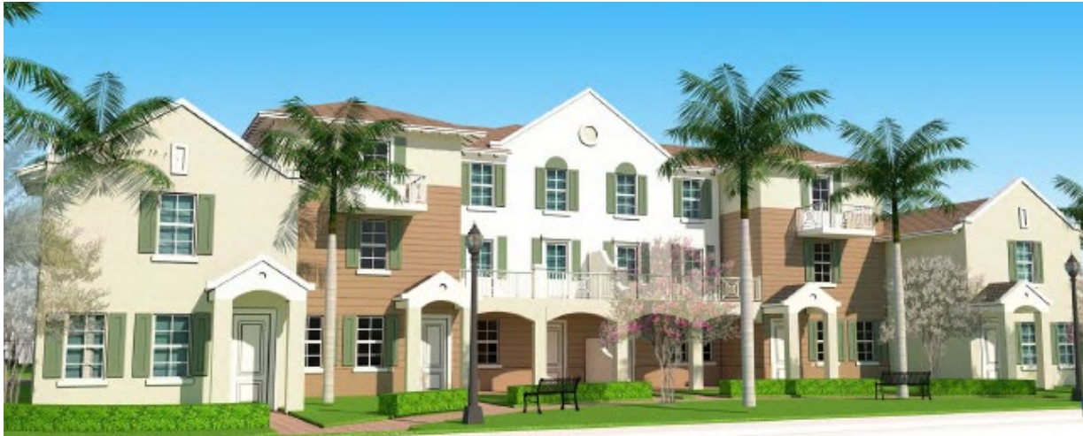
Building façade #1