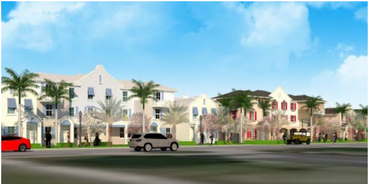
SW 12 th Ave view

The following renderings are of the originally conceived, for-sale townhome development. However, DBHA and Smith & Henzy intend to work with the architect to utilize this design for Island Cove Apartments.