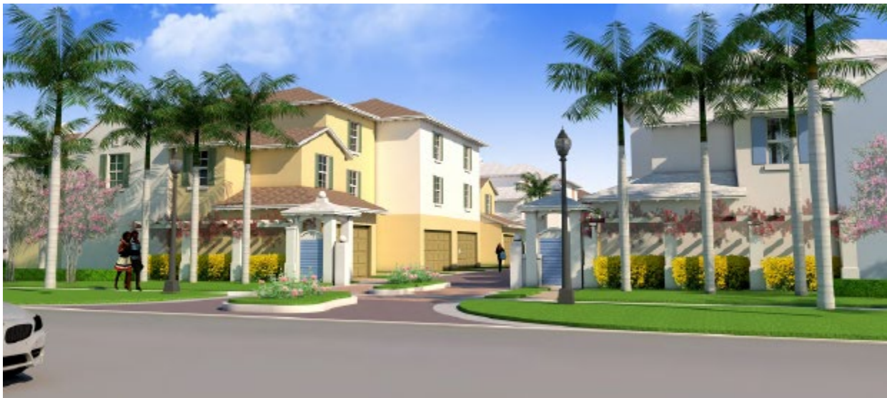
SW 13 th St view