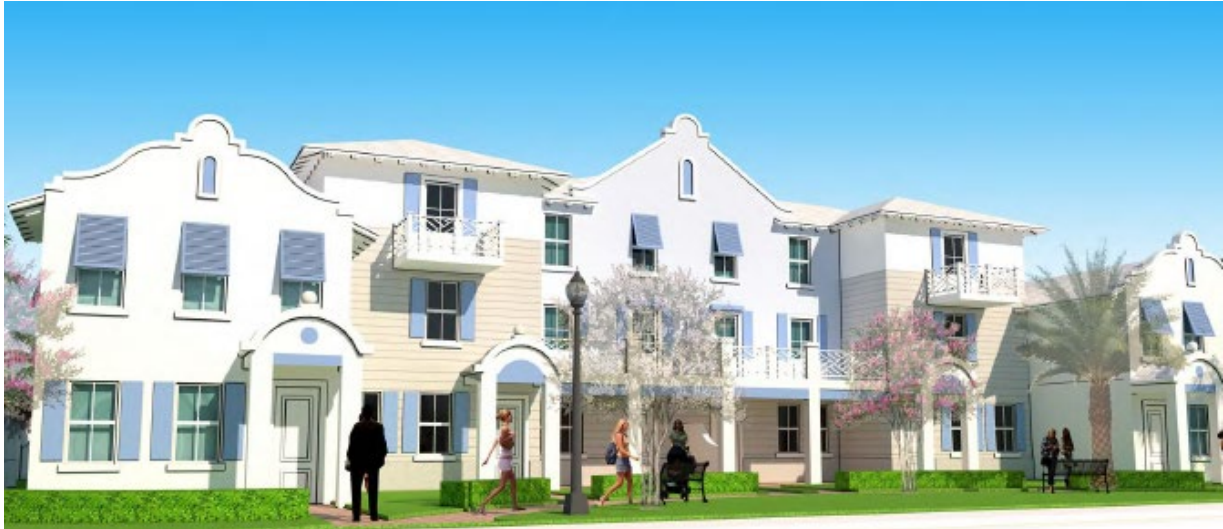
Building façade #2