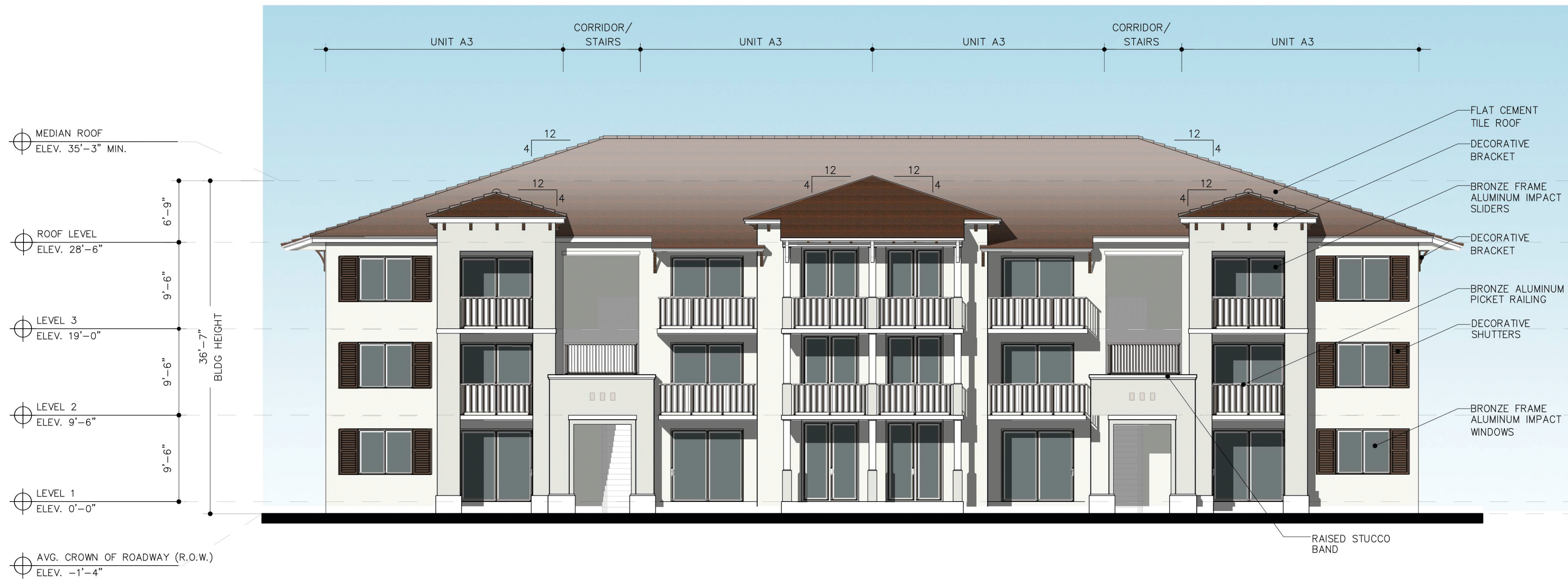
1 FRONT / REAR ELEVATION