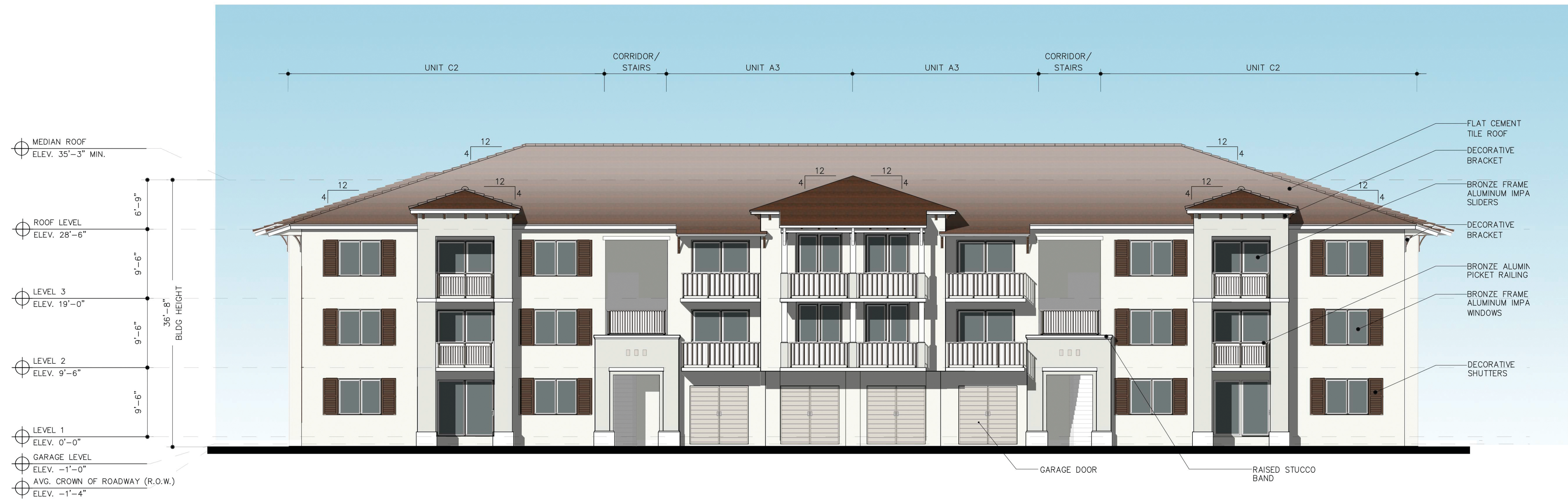
1 FRONT / REAR ELEVATION