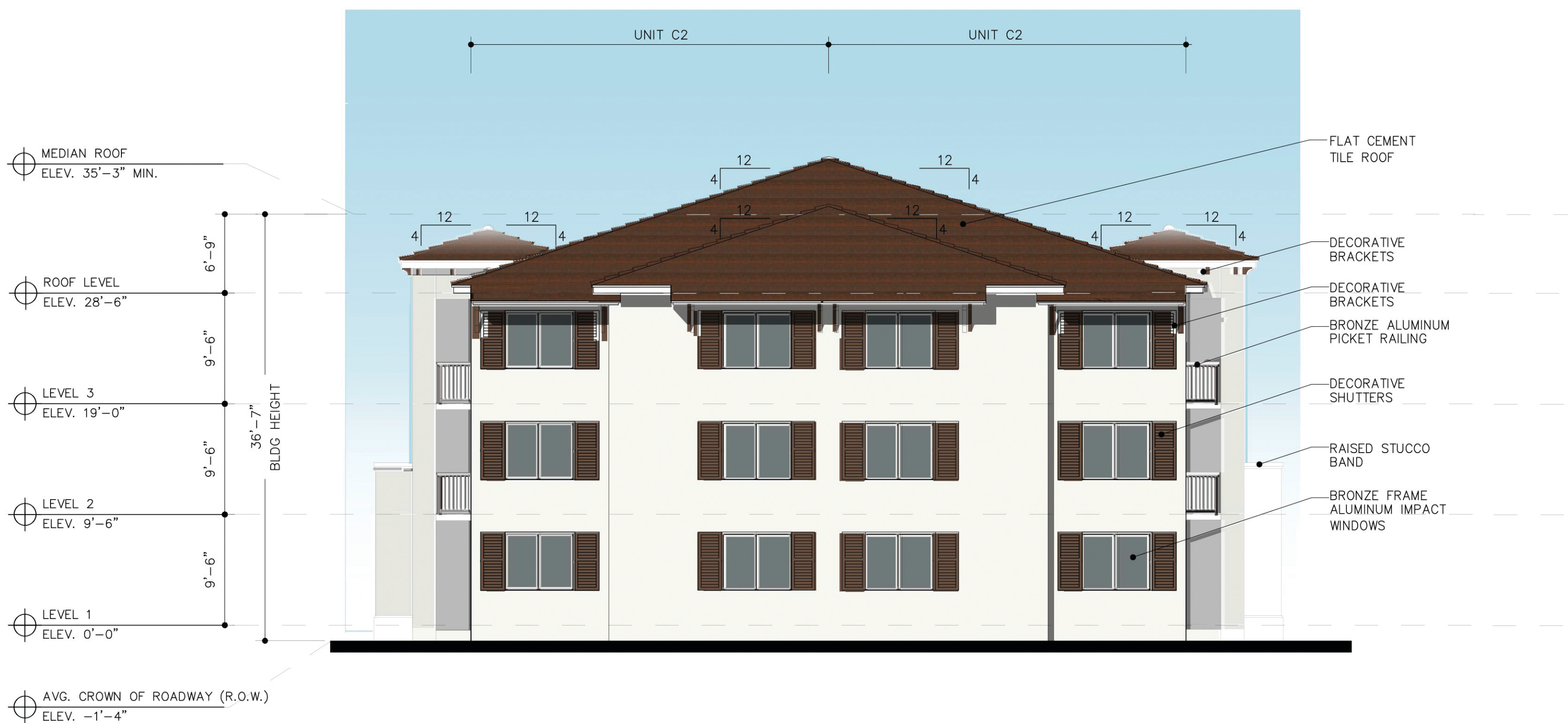
2 LEFT / RIGHT ELEVATION