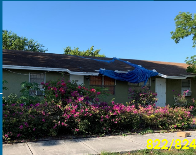
822/824 SW 1 Street