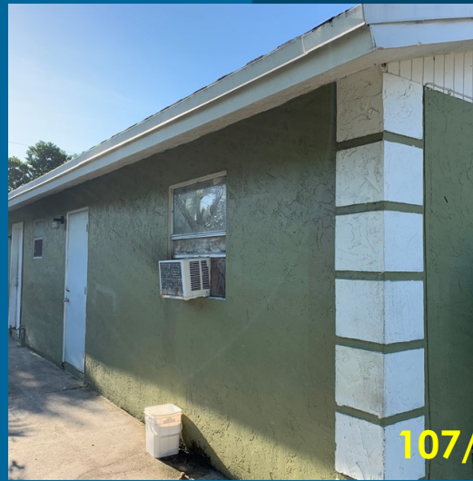
107/109 SW 9 Avenue