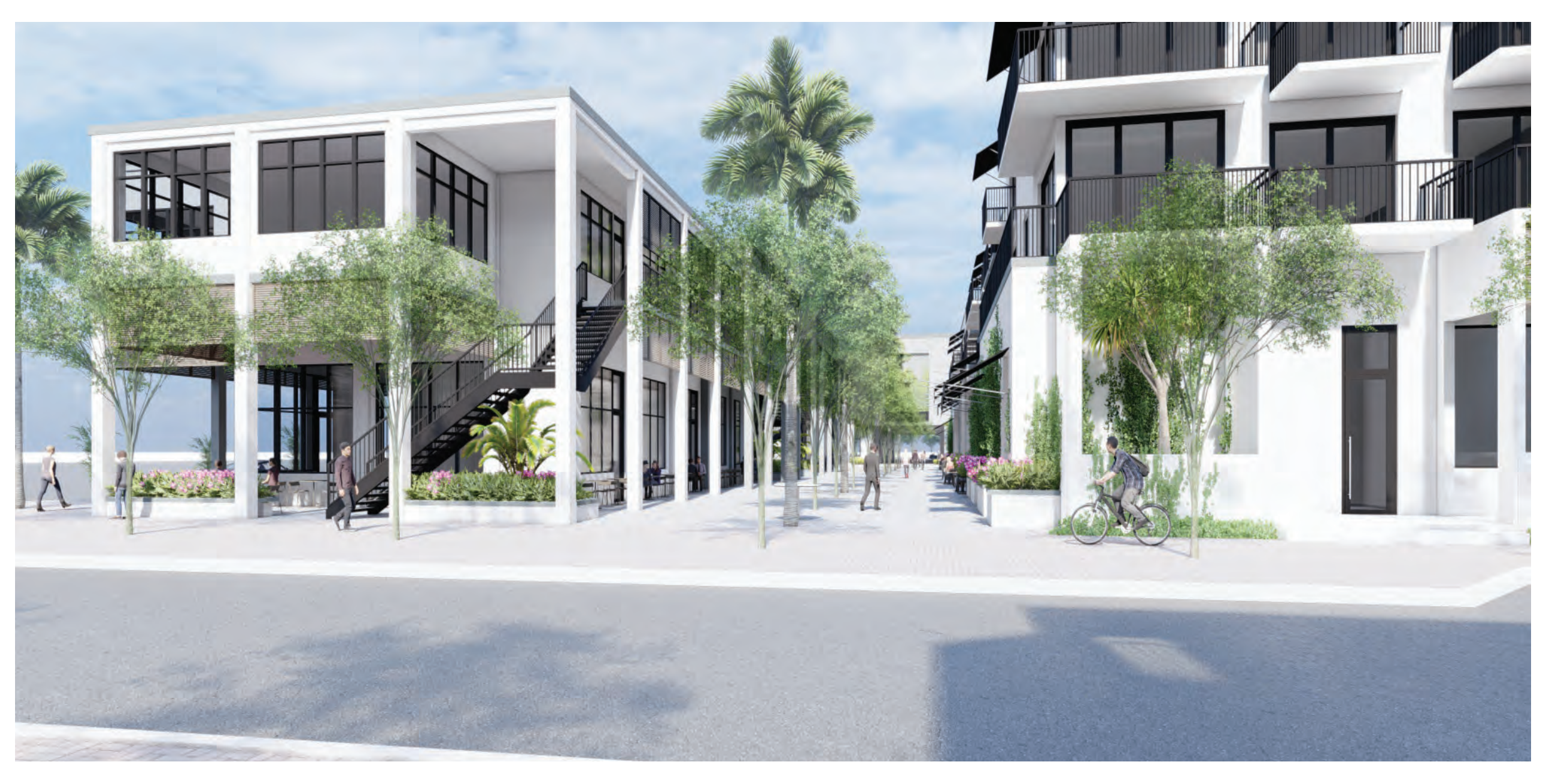
LOOKING EAST AT 700 BLOCK PROMENADE FROM SW 8TH AVE