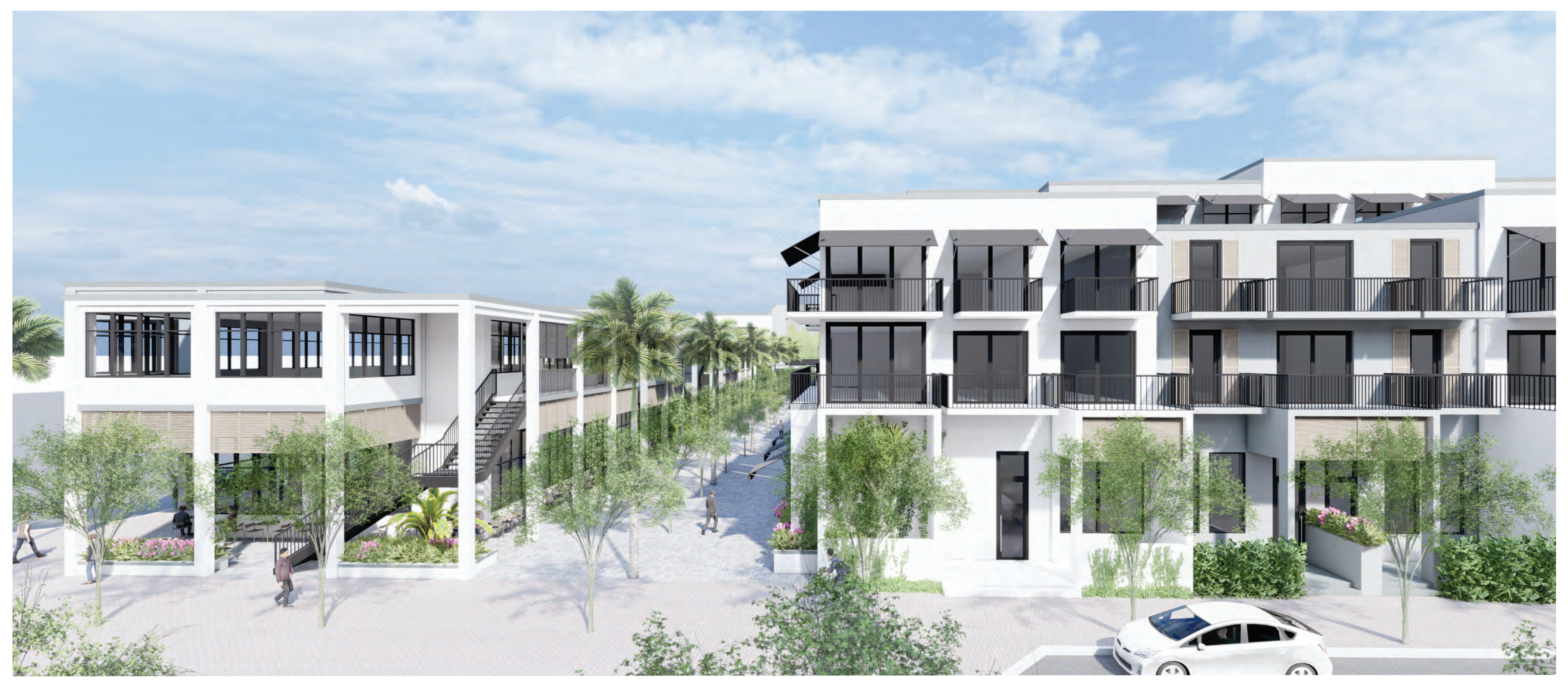
LOOKING EAST AT 700 BLOCK FROM SW 8TH AVE