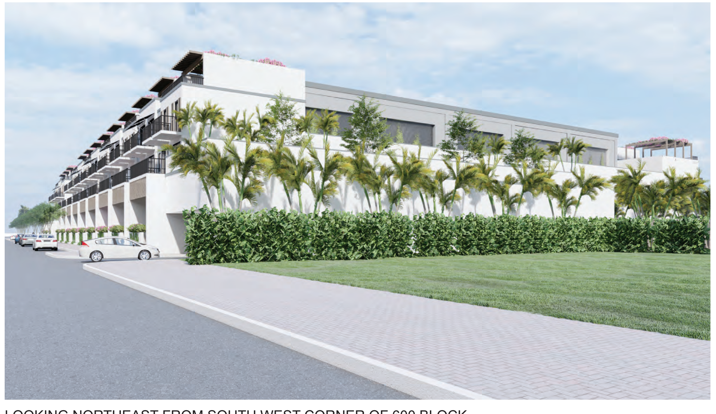
LOOKING NORTHEAST FROM SOUTH WEST CORNER OF 600 BLOCK