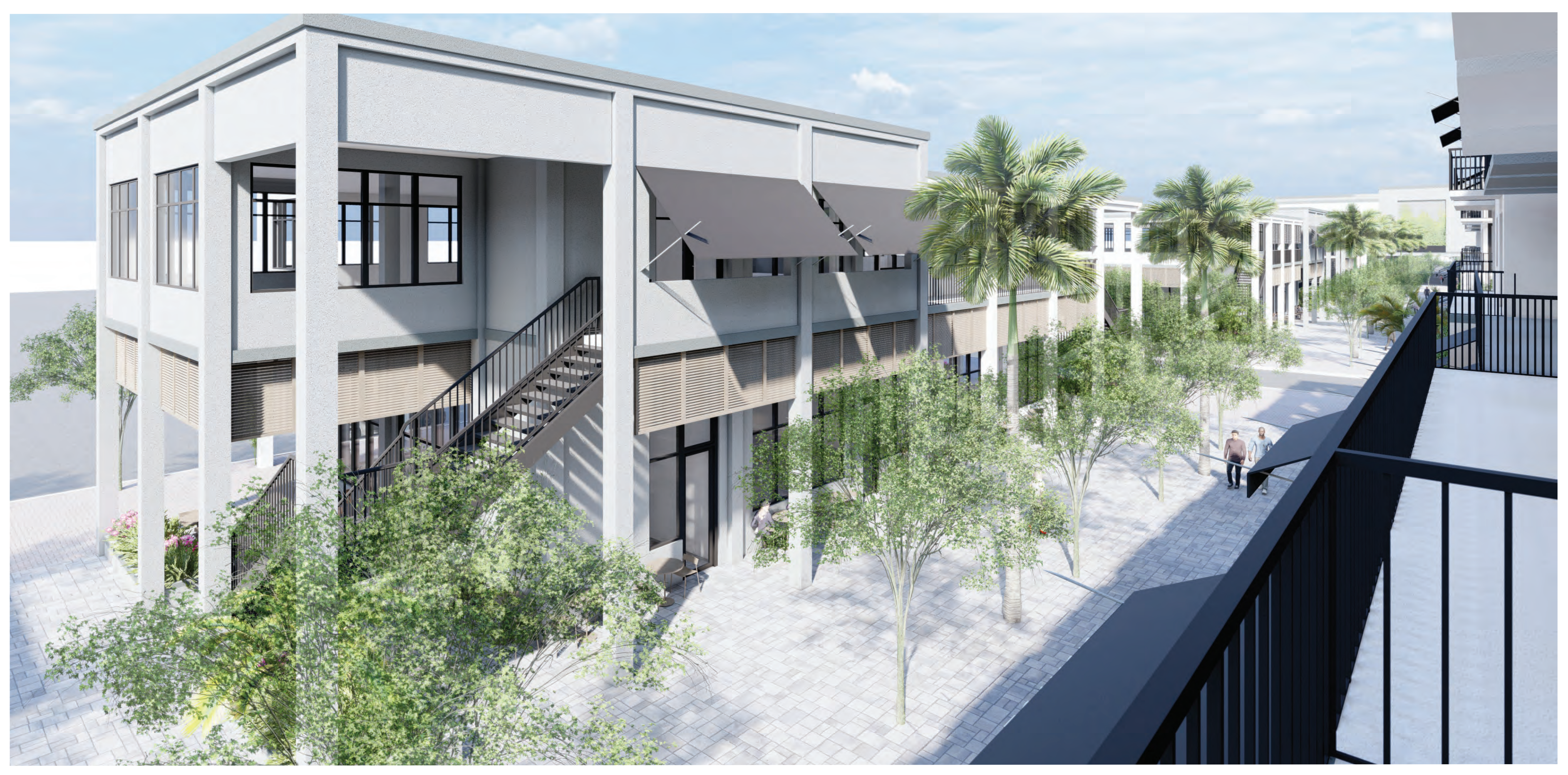
LOOKING EAST AT INTERIOR OF 800 BLOCK PROMENADE