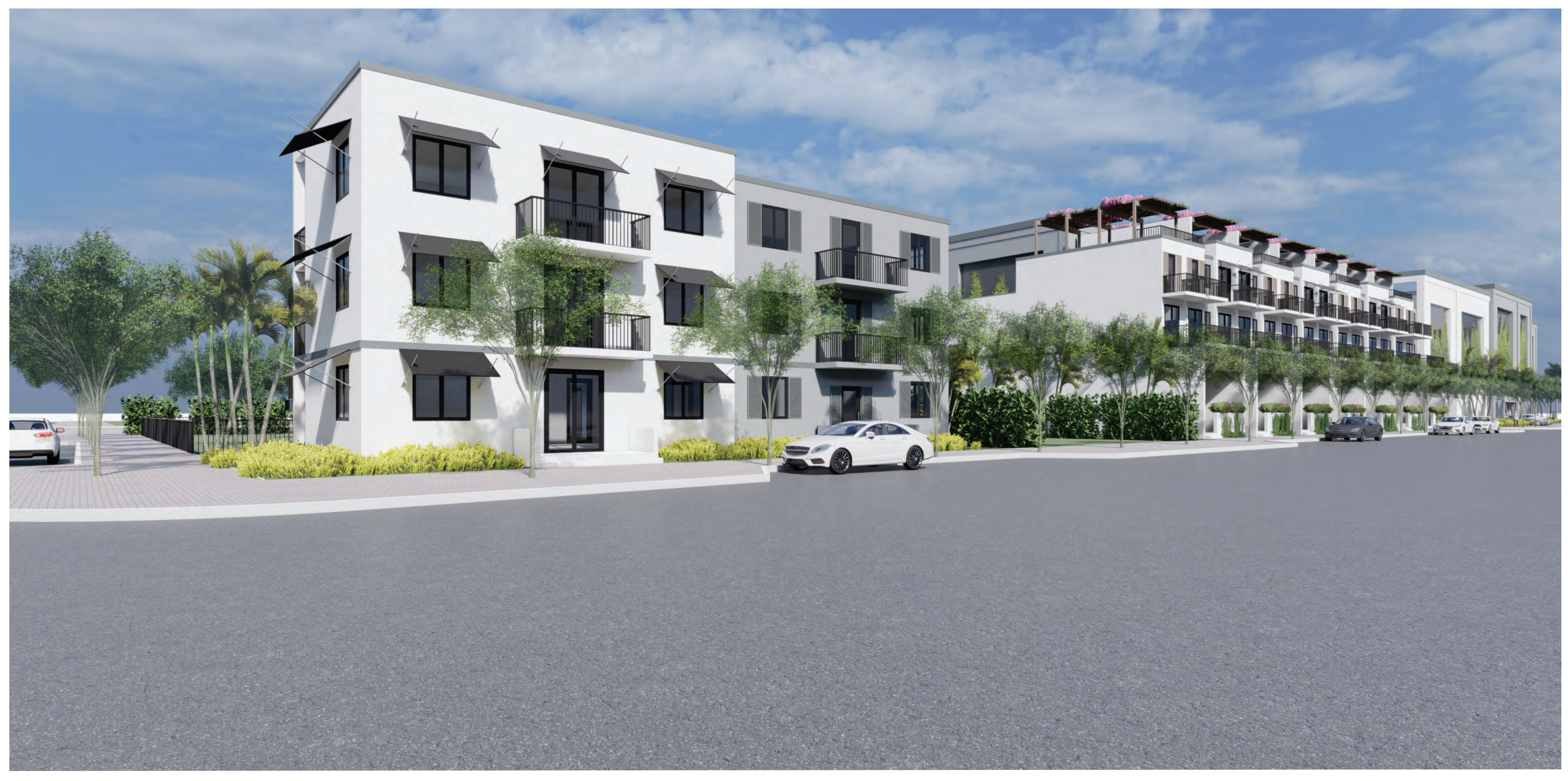
LOOKING NORTHEAST AT SOUTHEAST 600 BUILDING