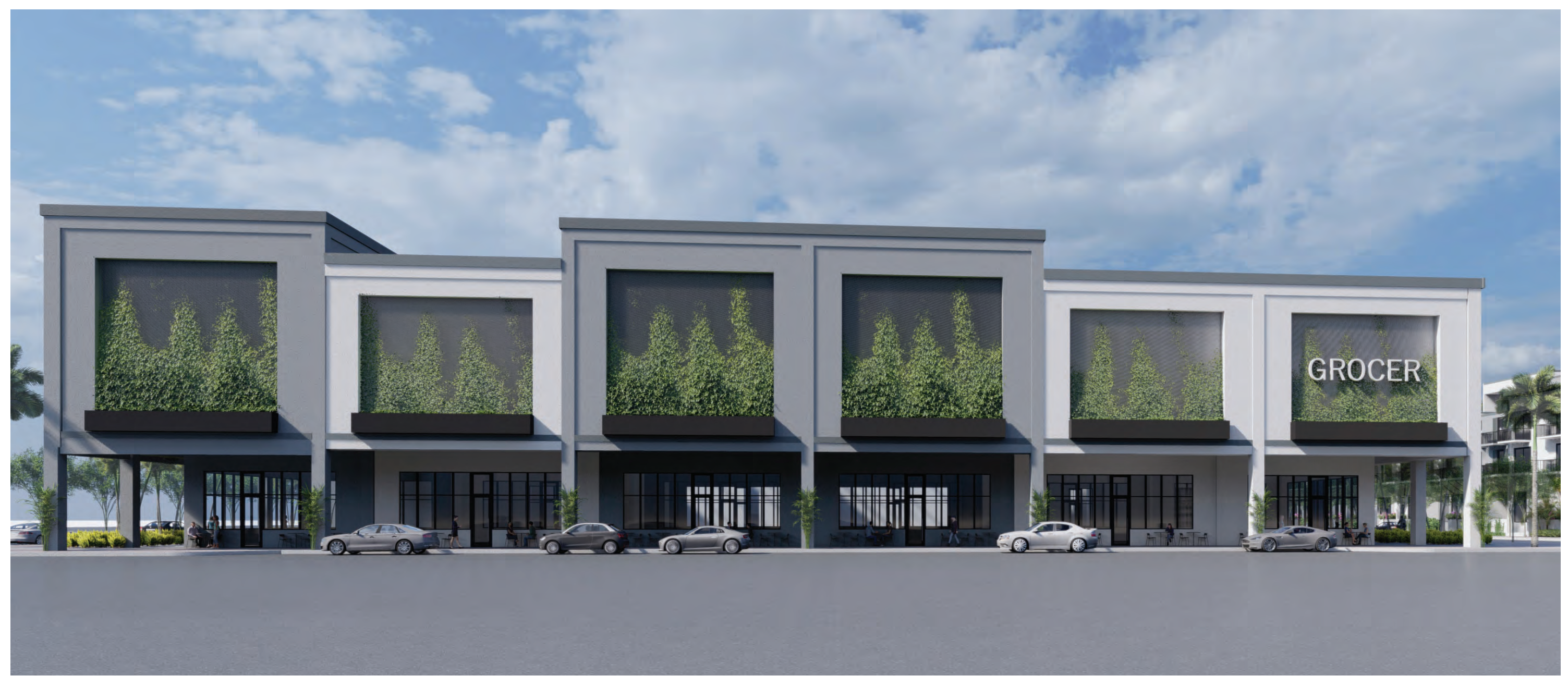
LOOKING SOUTH AT 600 BLOCK FROM ATLANTIC AVE