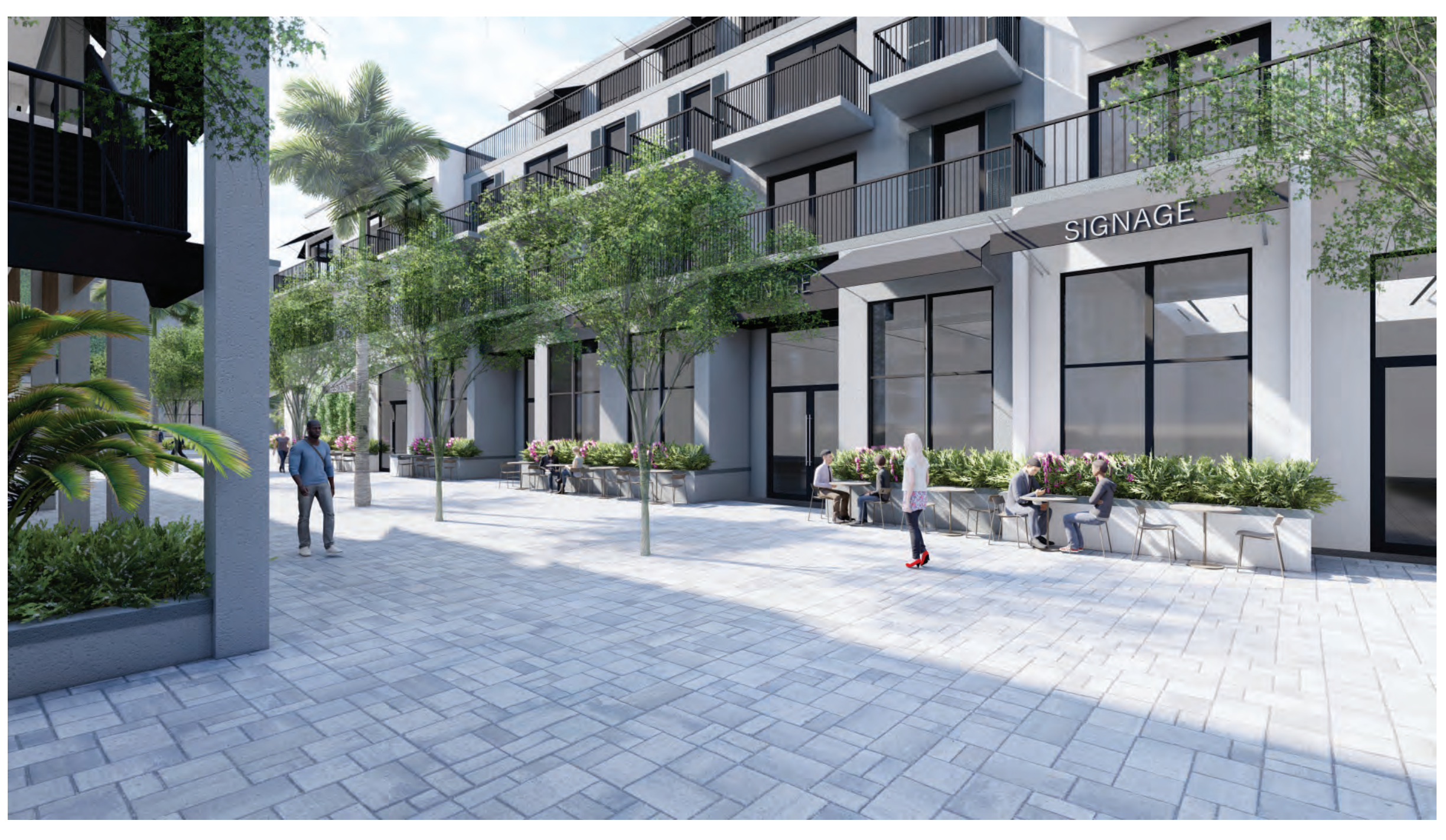
LOOKING SOUTHEAST AT 700 BLOCK PROMENADE INTERIOR