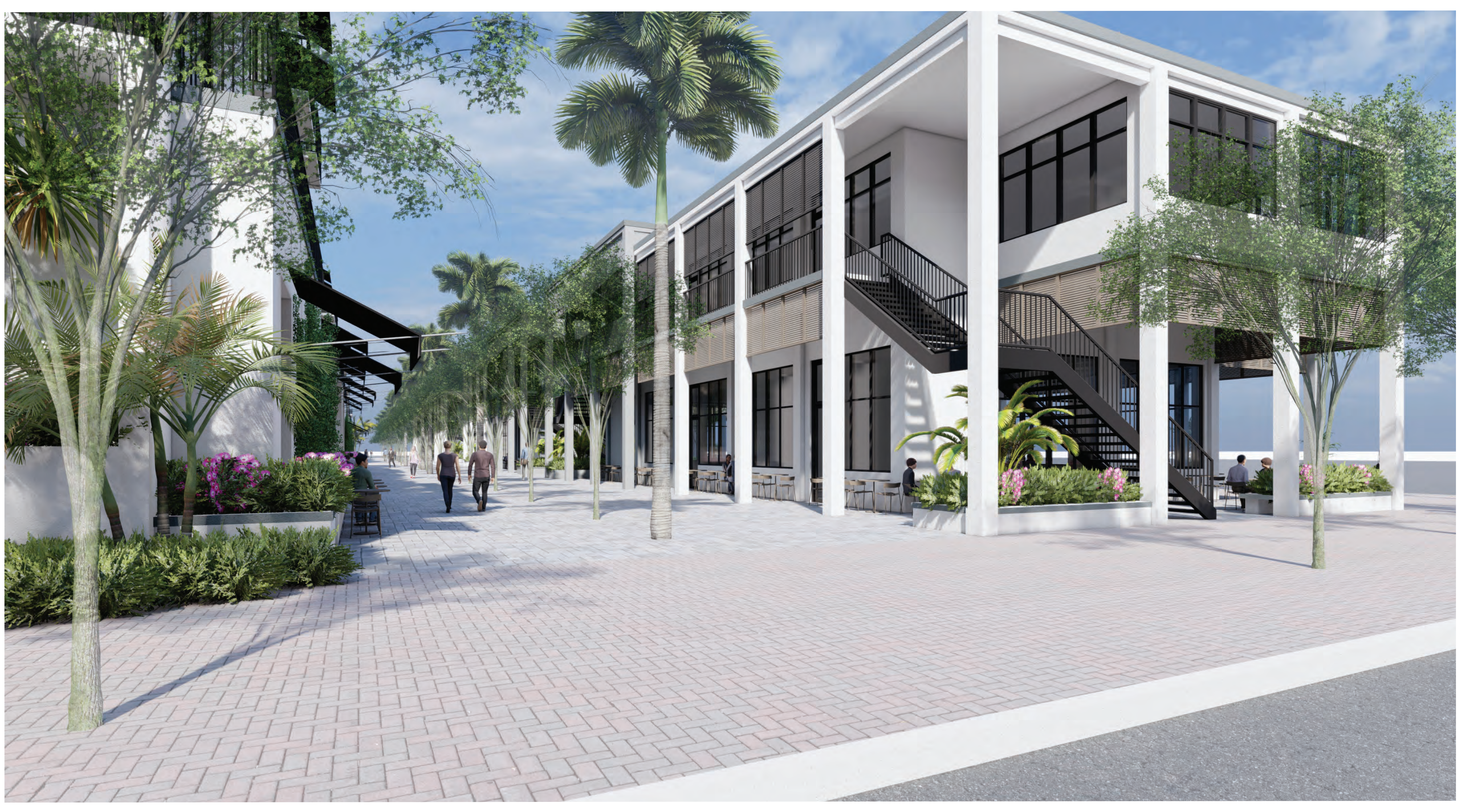
LOOKING WEST AT 700 BLOCK PROMENADE FROM SW 7TH AVE