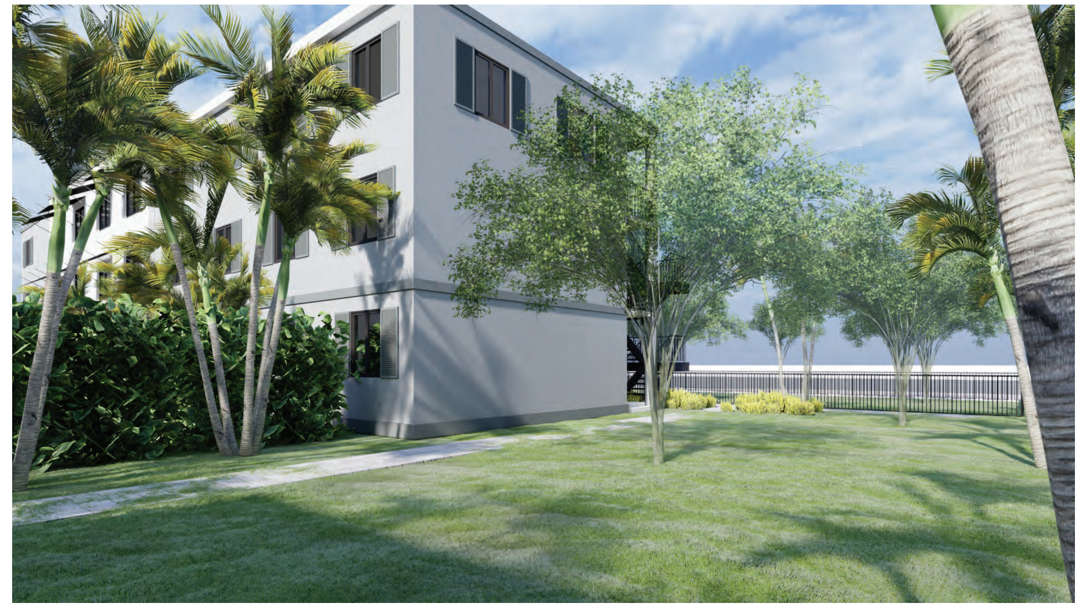
LOOKING SOUTH AT SOUTHEAST 600 BUILDING