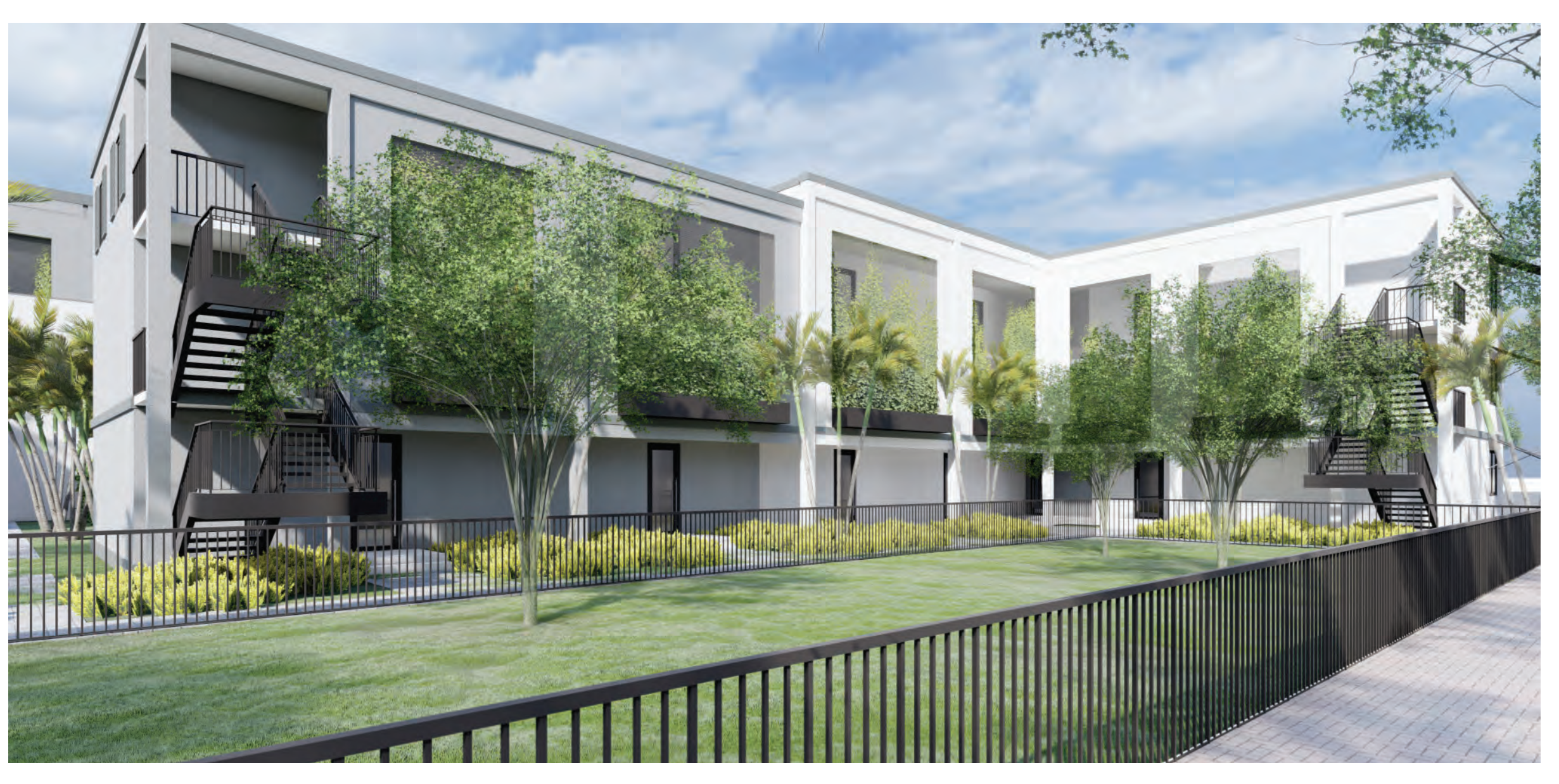
LOOKING SOUTHEAST AT 600 SOUTHEAST BUILDING