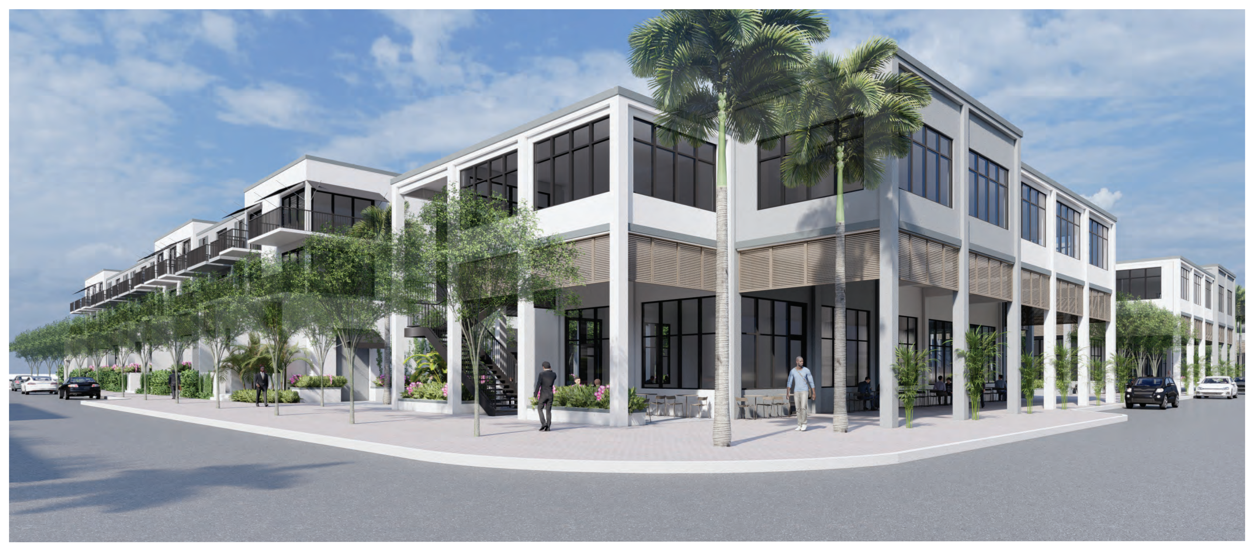
LOOKING SOUTHWEST ON 700 BLOCK FROM ATLANTIC AVE