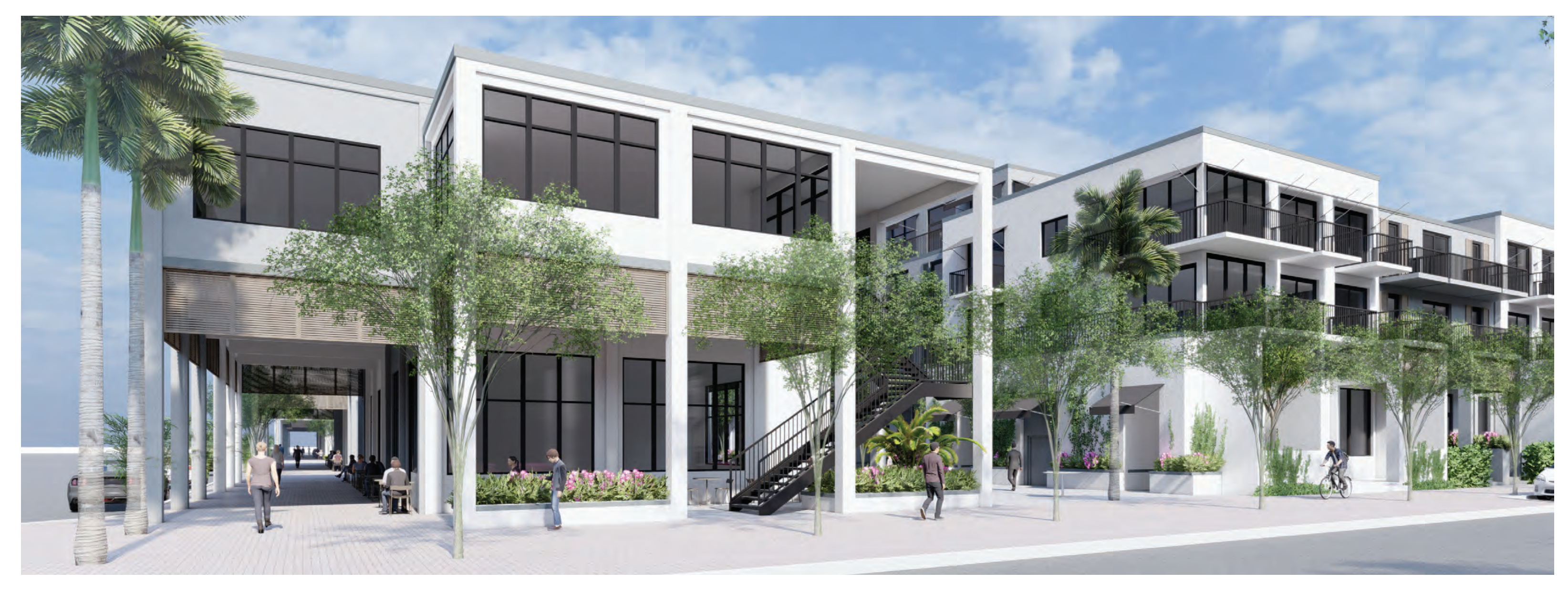
LOOKING SOUTHEAST AT 700 BLOCK FROM THE CORNER OF ATLANTIC AVE AND SW 8TH AVE