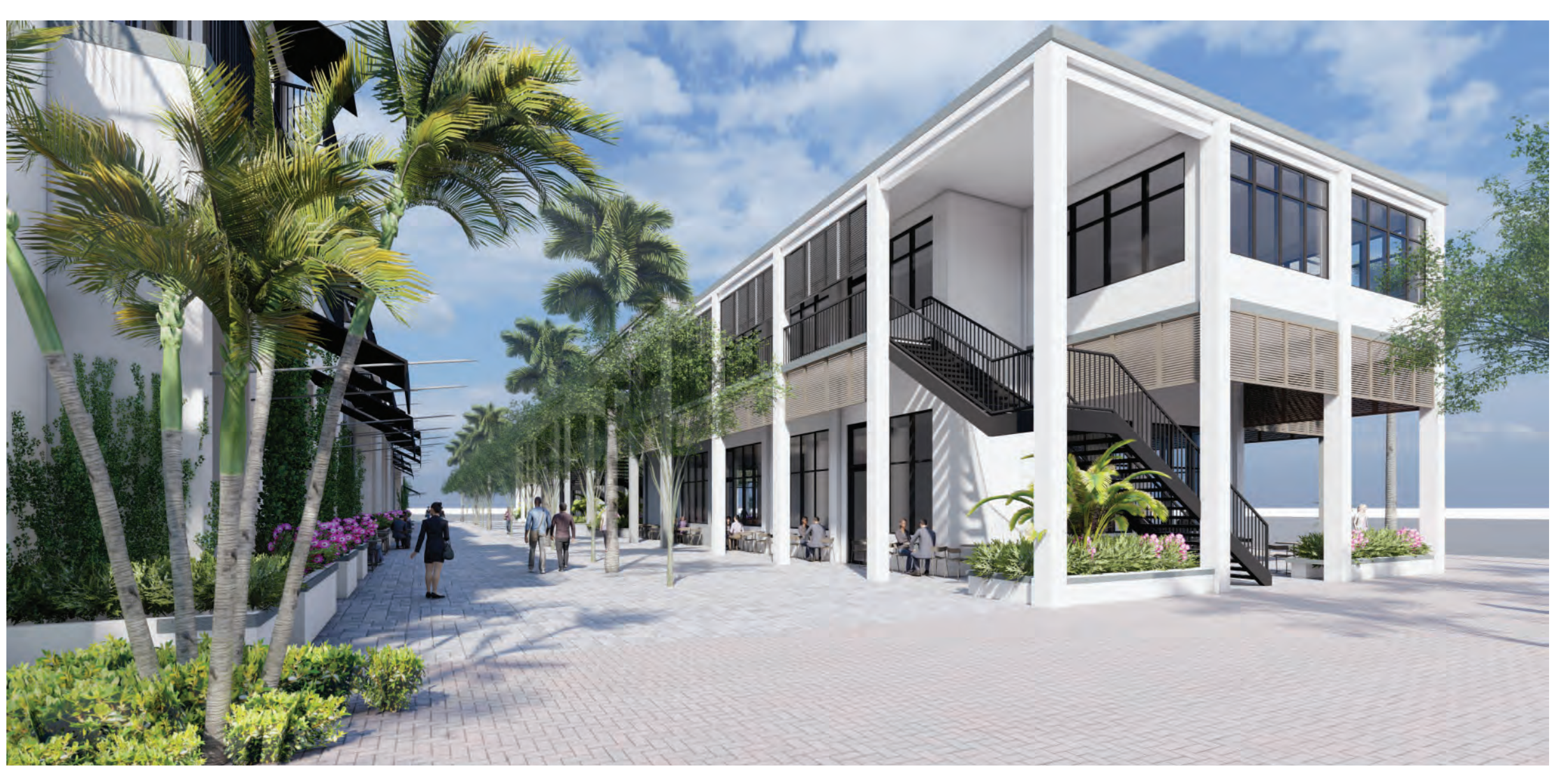
LOOKING NORTHWEST AT INTERIOR OF 800 BLOCK PROMENADE