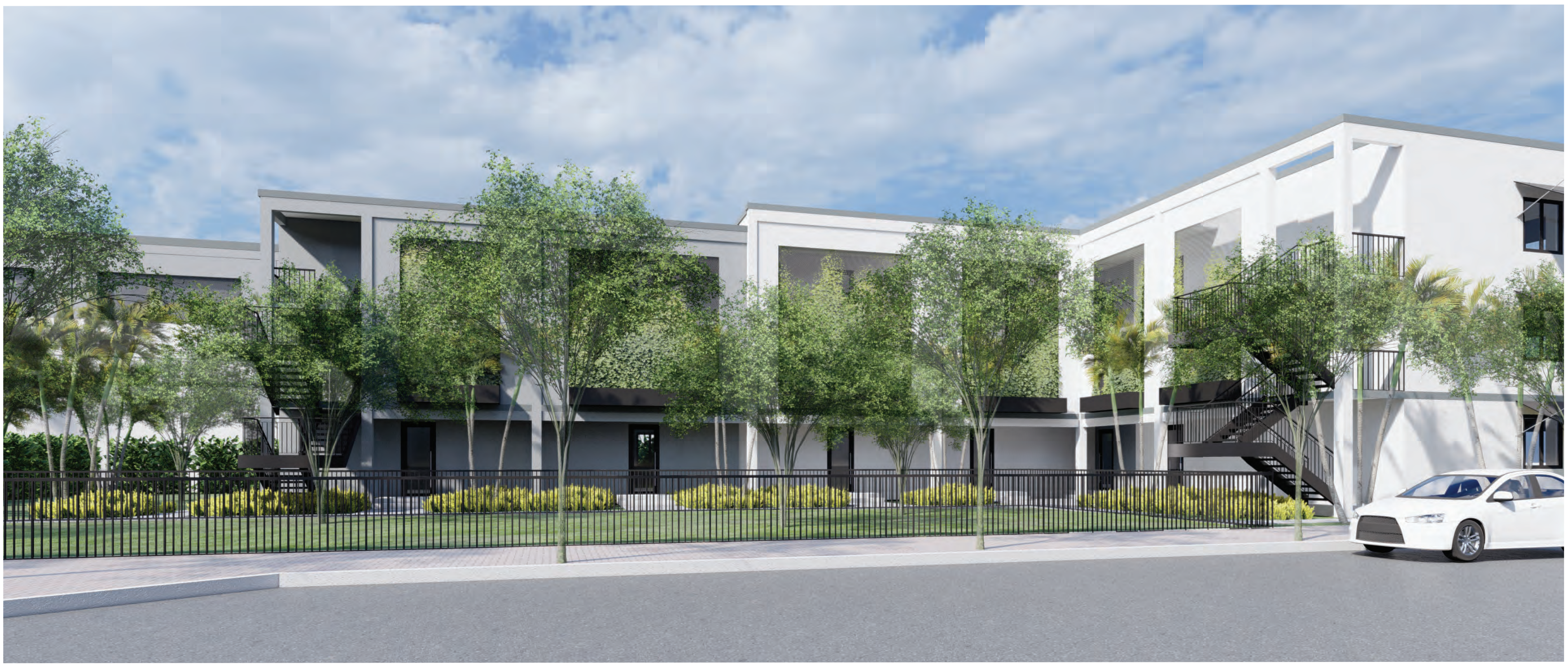
LOOKING SOUTHEAST AT 600 SOUTHEAST BUILDING