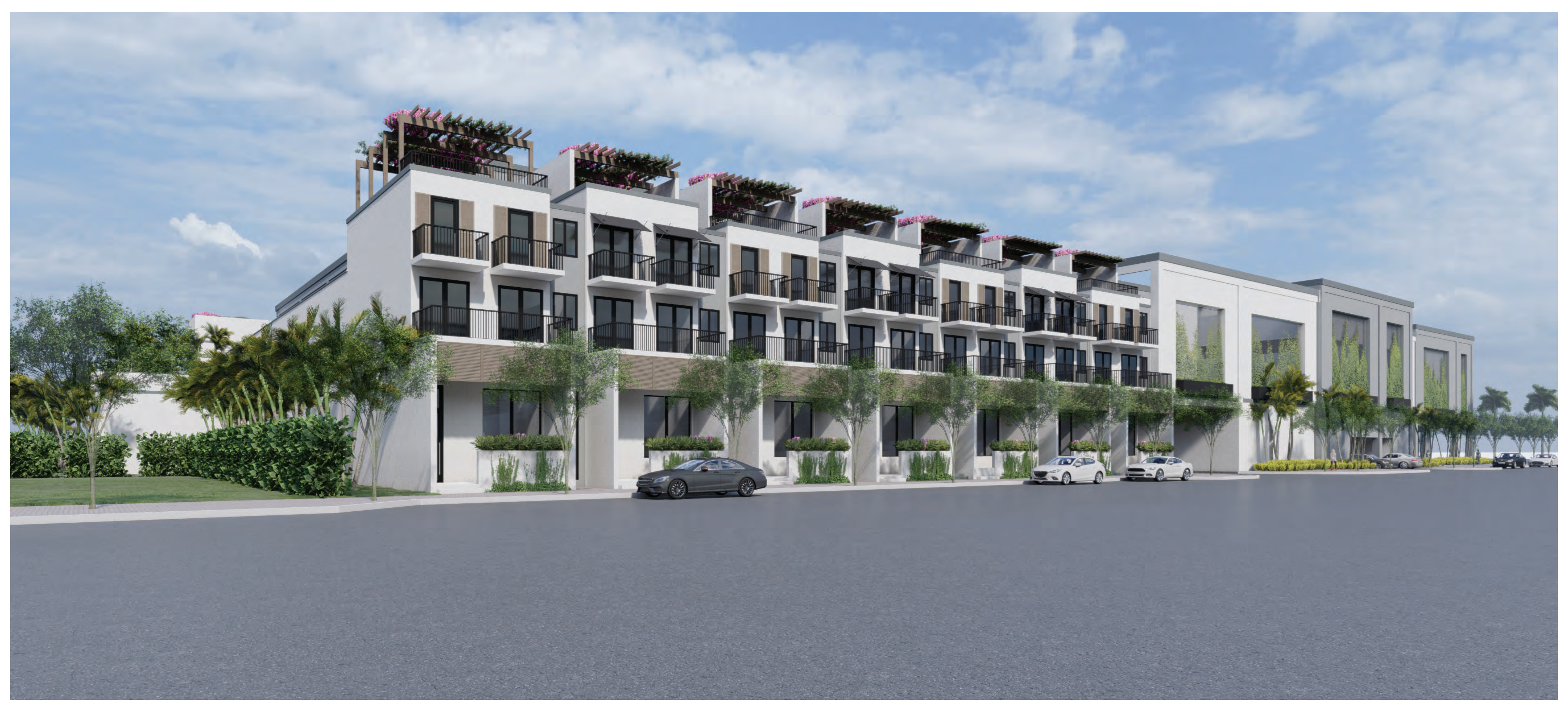
LOOKING EAST AT NORTHWEST FROM SOUTHEAST CORNER OF 600 BLOCK