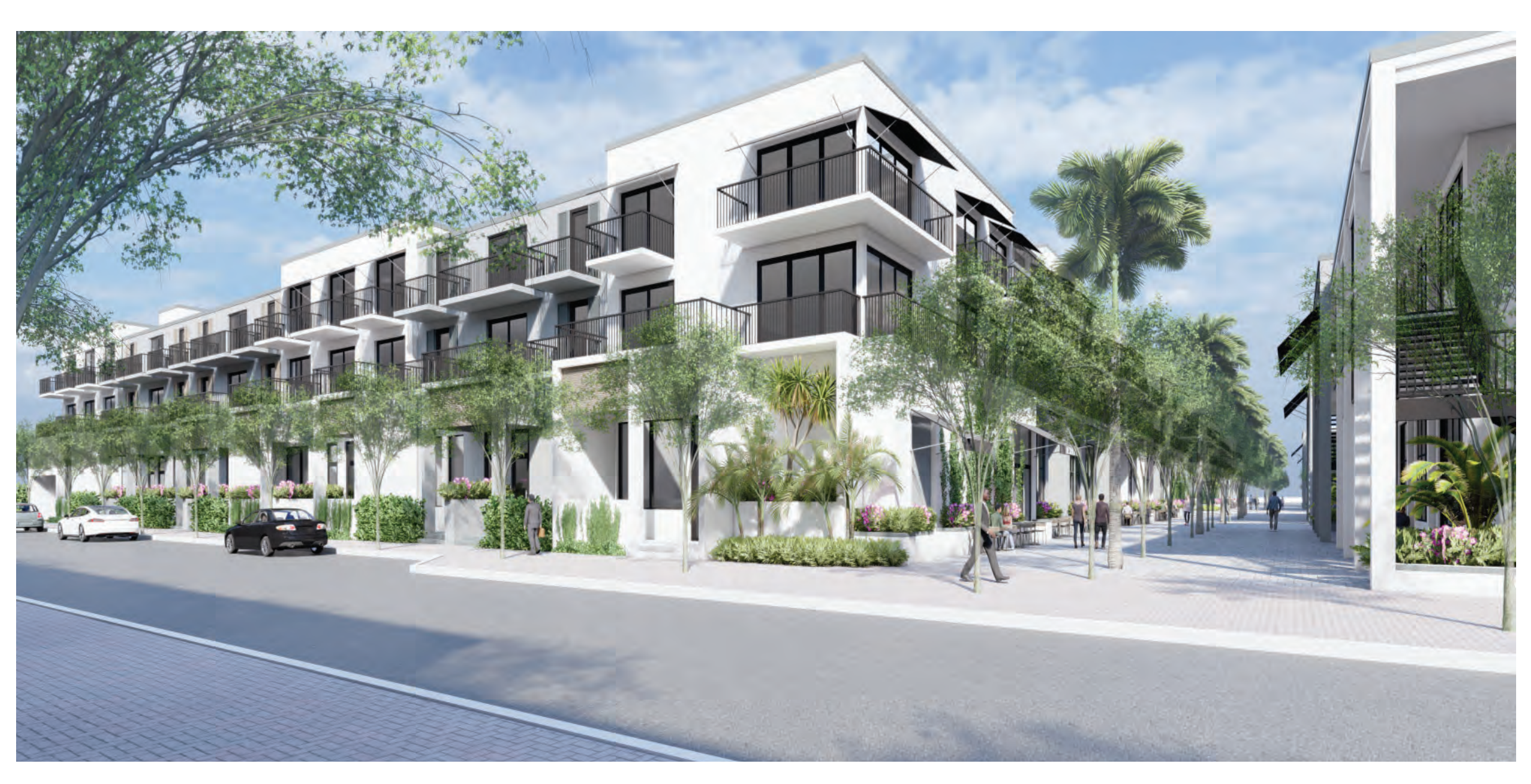
LOOKING EAST AT 700 BLOCK SW 7TH AVE