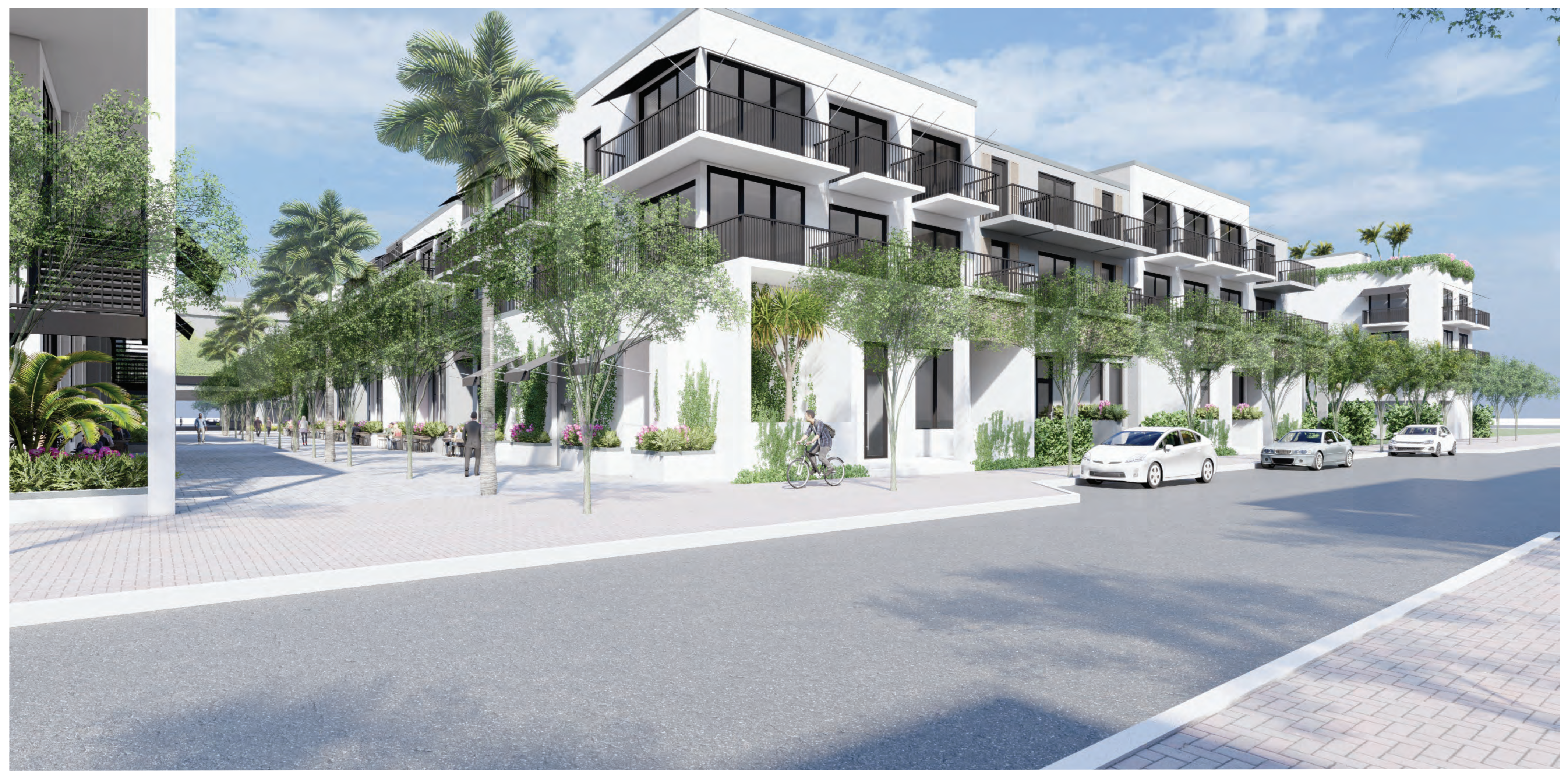
LOOKING SOUTHEAST AT 700 BLOCK FROM CORNER OF ATLANTIC AVE AND SW 8TH AVE