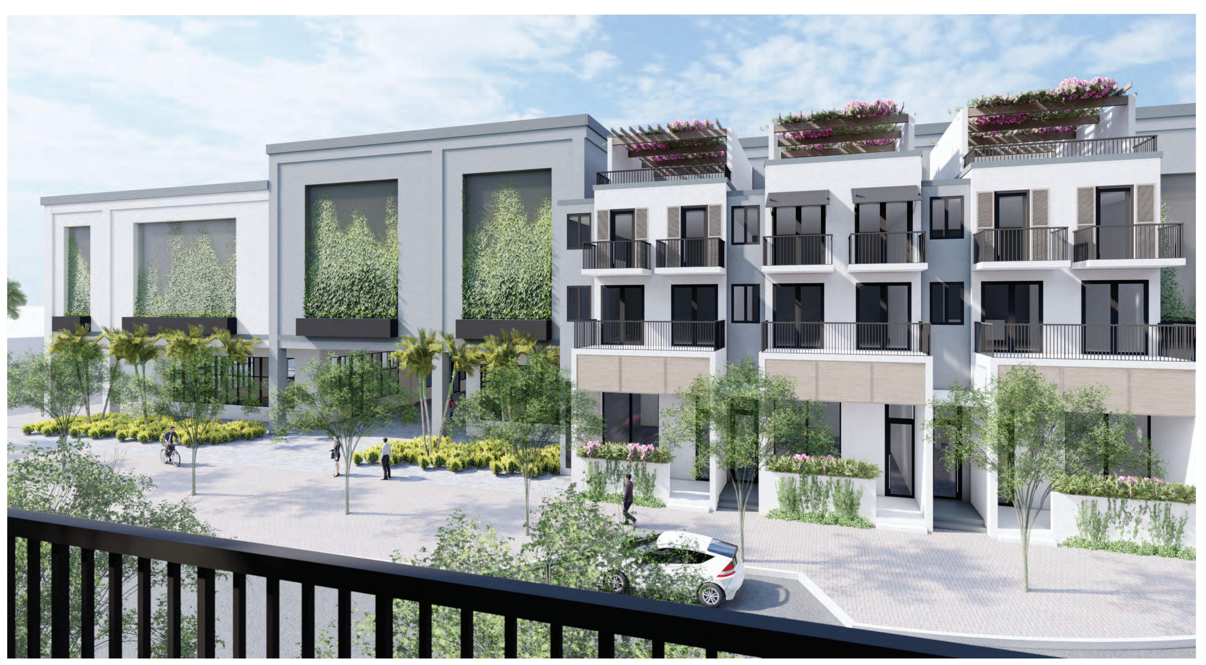
LOOKING EAST AT NORTH EAST CORNER OF 600 BLOCK