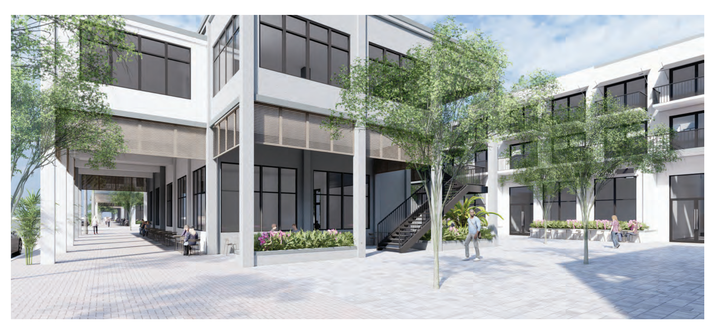
LOOKING EAST AT INTERIOR OF 800 BLOCK ARCADE FROM CORNER OF ATLANTIC AVE AND SW 9TH AVE