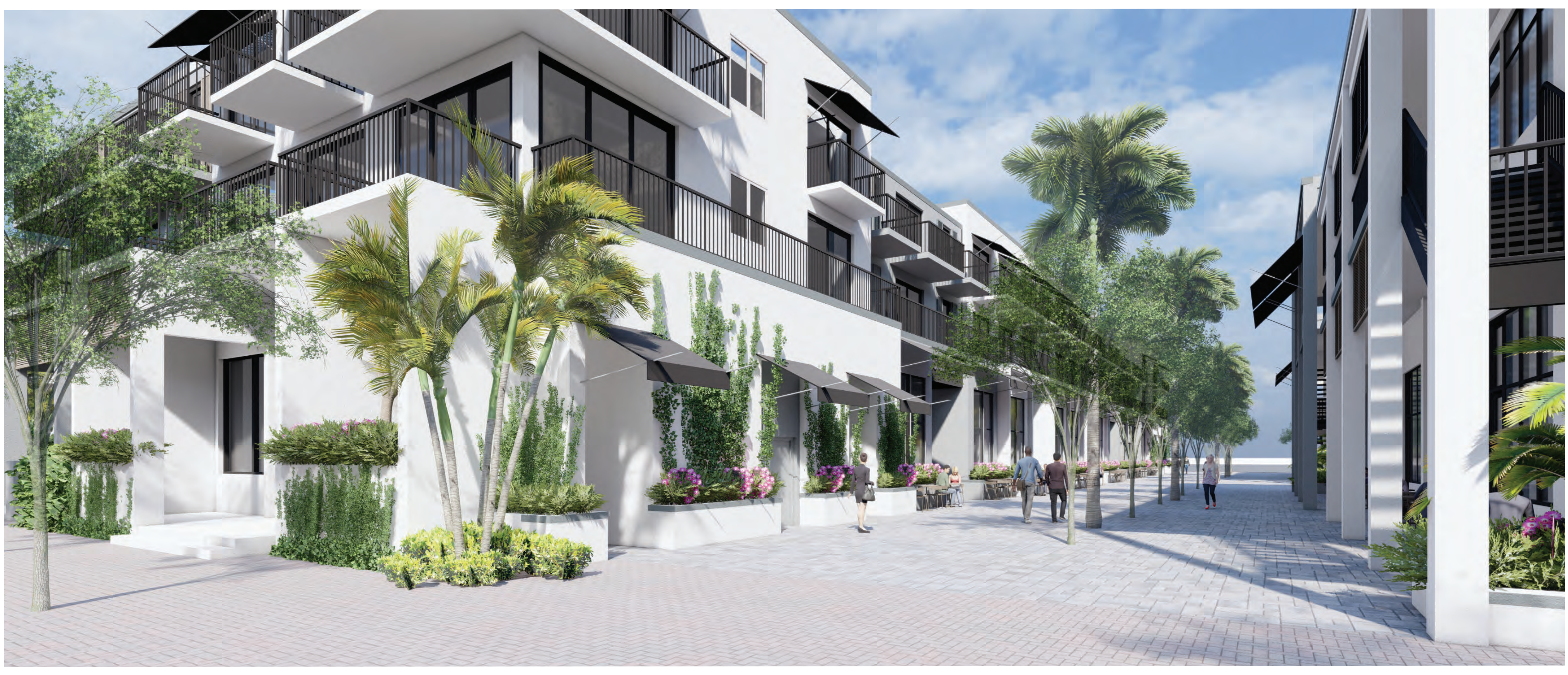
LOOKING WEST AT INTERIOR OF 800 BLOCK PROMENADE