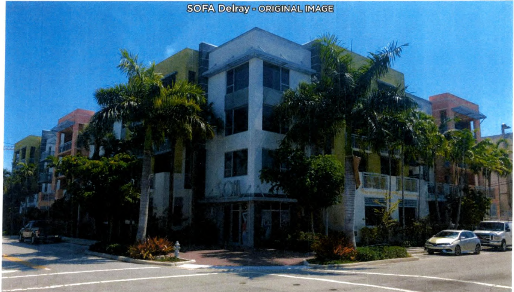
SOFA Delray - ORIGINAL IMAGE