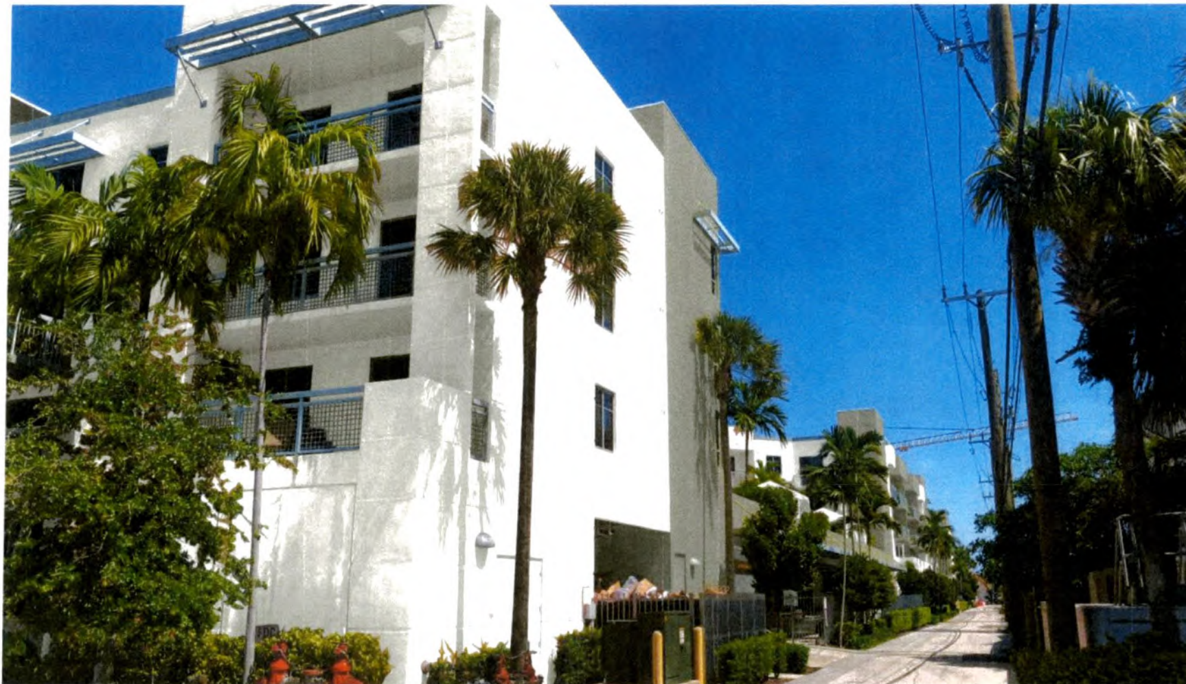
SW 7005 Pure White Body 1