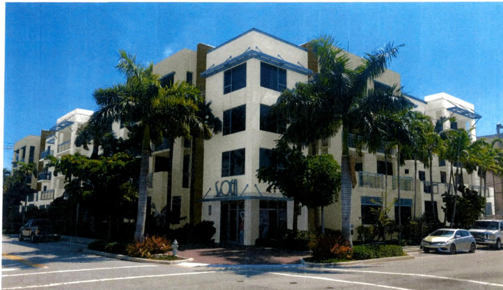
SW 7005 Pure White Body 1