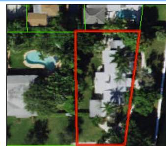
AERIAL PHOTOGRAPH (MAY NOT SHOW LATEST IMPROVEMENTS) (NOT-TO-SCALE)

BEARING REFERENCE: CENTER LINE OF NE 1st COURT AS S89°38'27"W ALL BEARINGS SHOWN HEREON REFERENCED THERETO.