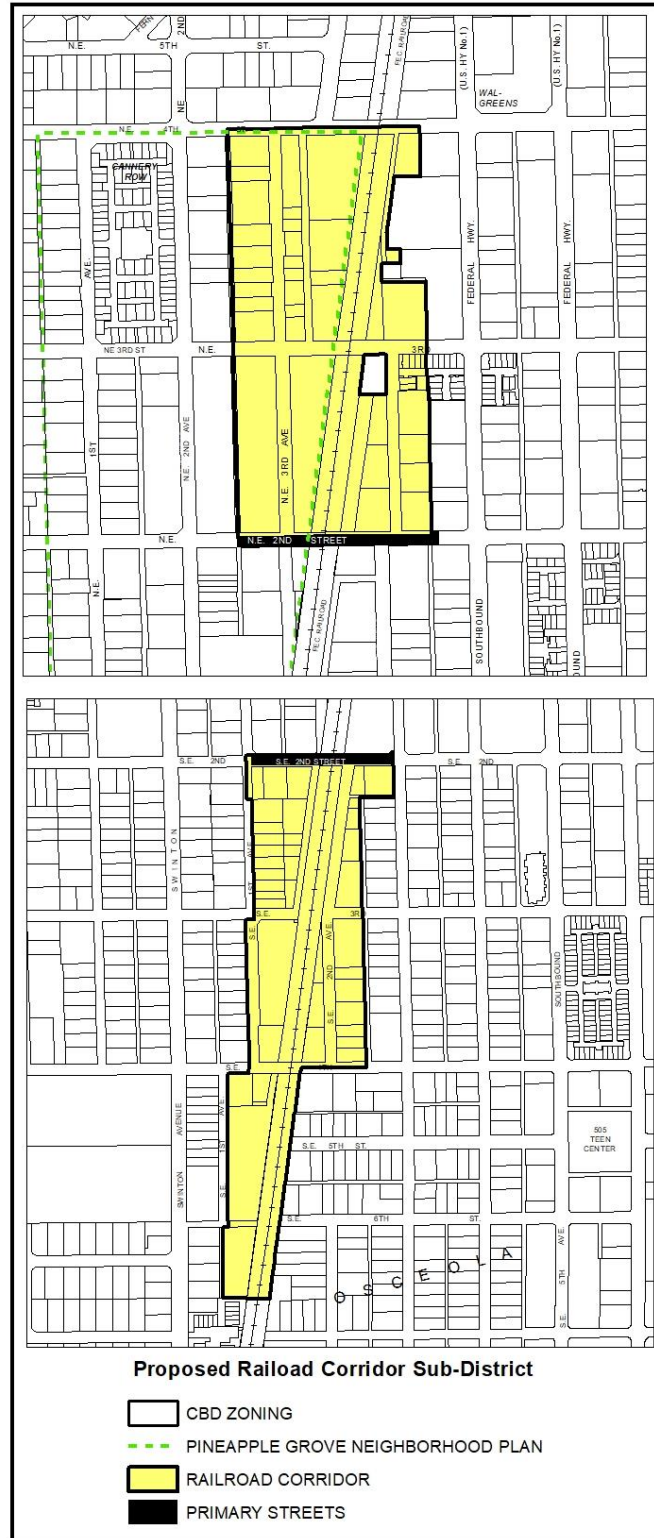
EXHIBIT "C" RAILROAD CORRIDOR SUB-DISTRICT REGULATING PLAN