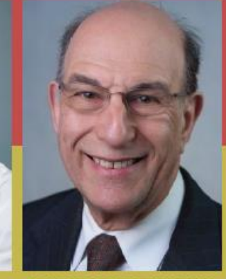
THE COLOR OF LAW: A FORGOTTEN HISTORY OF