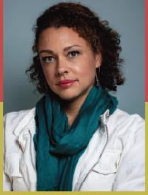
INVA K. SAUKS INVISIBLE VISITS, BLACK MIDDLE-CLASS WOMEN IN THE AMERICAN HEALTHCARE SYSTEM