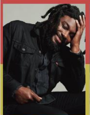
JASON REYNOLDS STAMPED: RACISM, ANTIRACISM 6 YOU