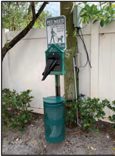
DETAIL B DOG WASTE STATION