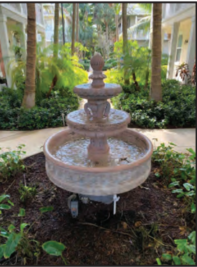
DETAIL A WATER FOUNTAIN