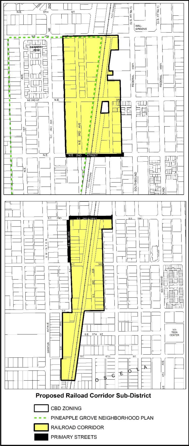
EXHIBIT "C" FIGURE 4.4.13-7 RAILROAD CORRIDOR SUB-DISTRICT REGULATING PLAN