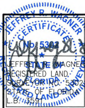
EXHIBIT A RIGHT-OF-WAY DEDICATION SKETCH OF LEGAL DESCRIPTION

CIVIL ENGINEERING LANDSCAPE ARCHITECTURE - SURVEYING 7900 GLADES ROAD - SUITE 100 BOCA RATON, FLORIDA 33434 PHONE (561)-392-1991 / FAX (561)-750-1452