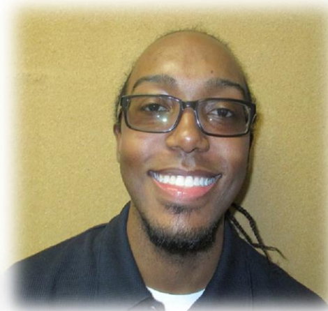
Digital /Social Media Coordinator – City Managers Office