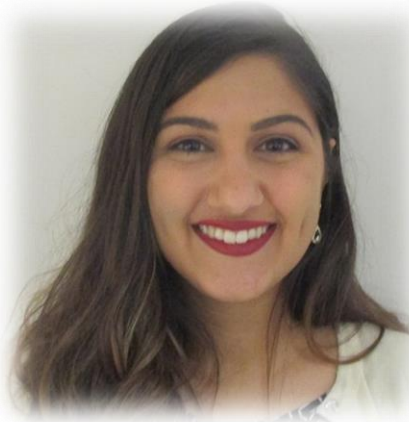
Planner – Development Services