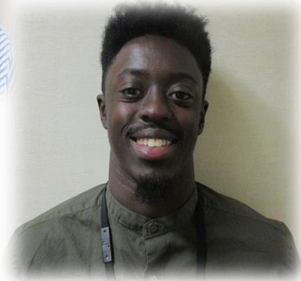
Assistant Planner / GIS Specialist – Development Services