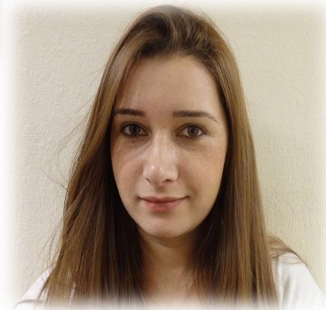
Senior Planner – Development Services