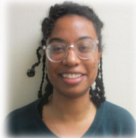
Assistant Planner – Development Services