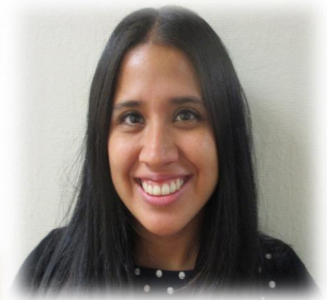
Assistant Human Resources Generalist – Human Resources