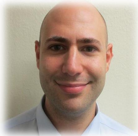
Accountant – Finance