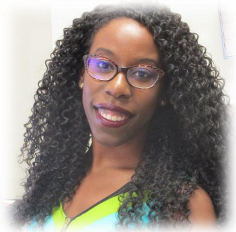
Human Resources Generalist – Human Resources