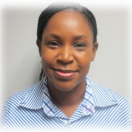
Customer Service Representative – Finance